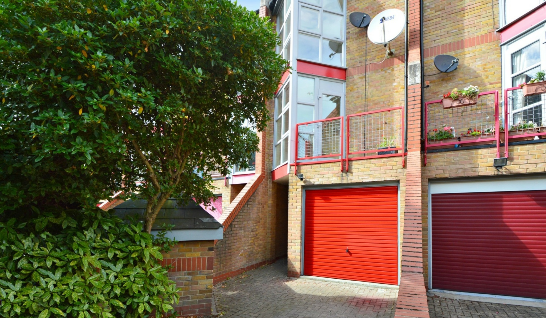
HOLYOAKE COURT SE16 3 bedroom town house