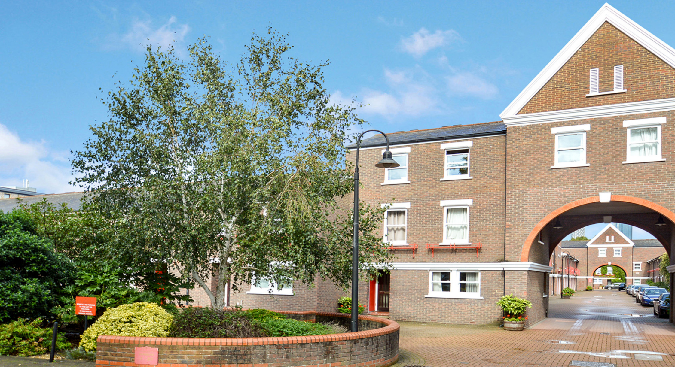
LOCKESFIELD PLACE E14 1 bedroom apartment