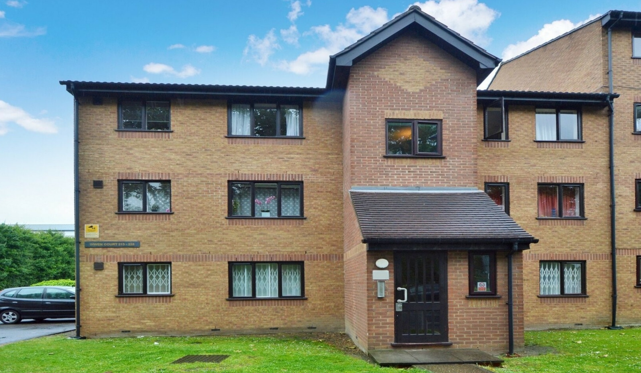
INWEN COURT SE8 1 bedroom apartment