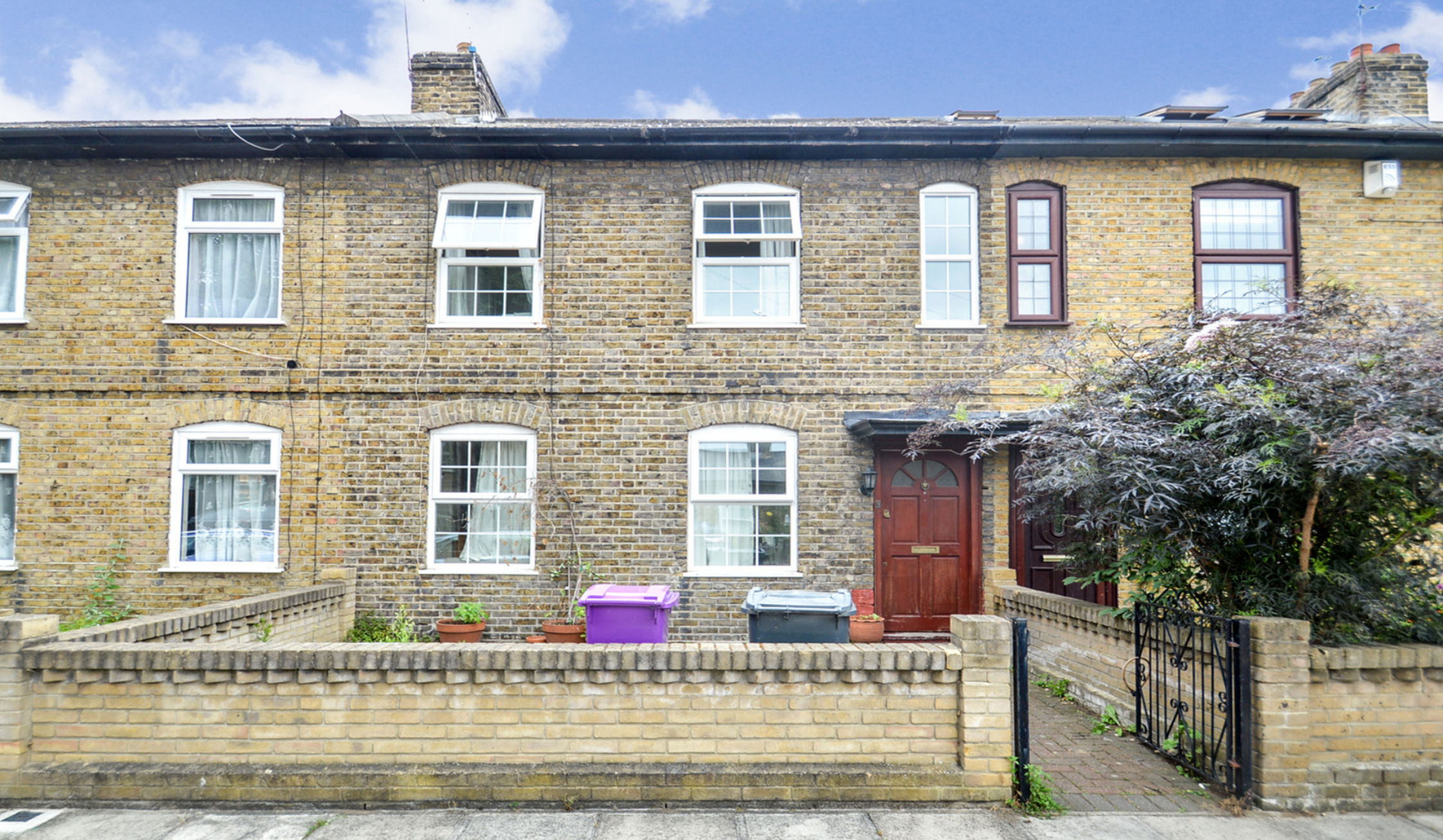
CHAPEL HOUSE STREET E14 3 bedroom terraced house