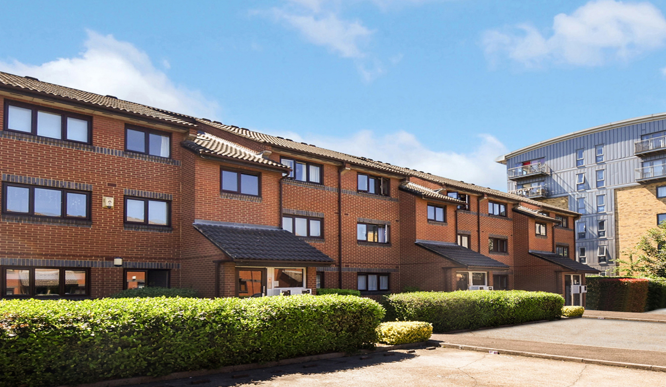
BRYMAY CLOSE E3 1 bedroom apartment