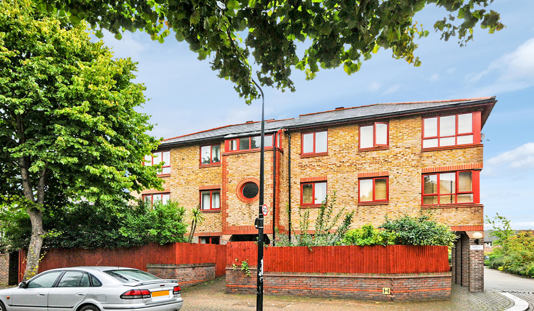
BALTIC COURT SE16 2 bedroom apartment