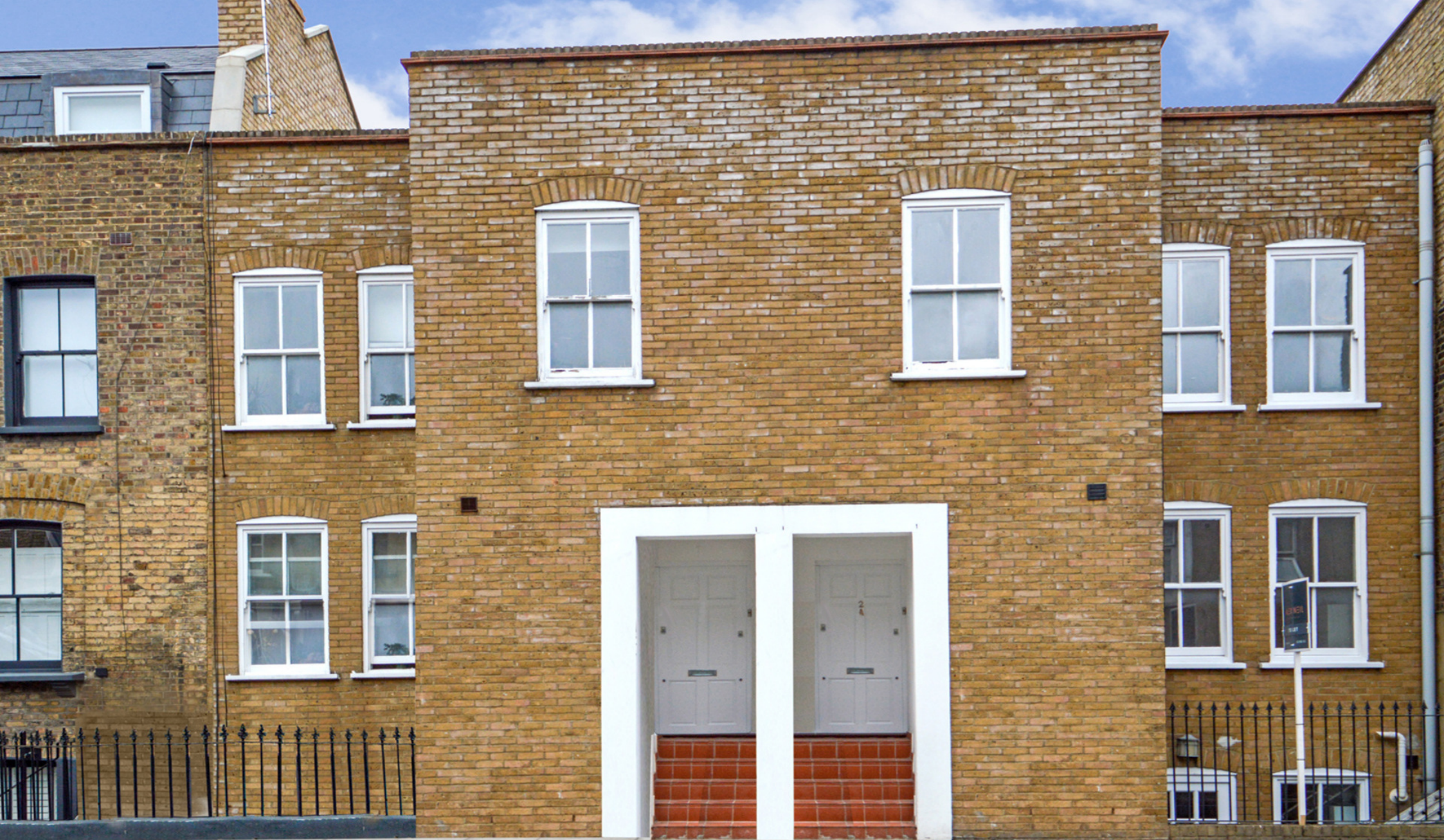
ELLESMERE ROAD E3 3 bedroom terraced house