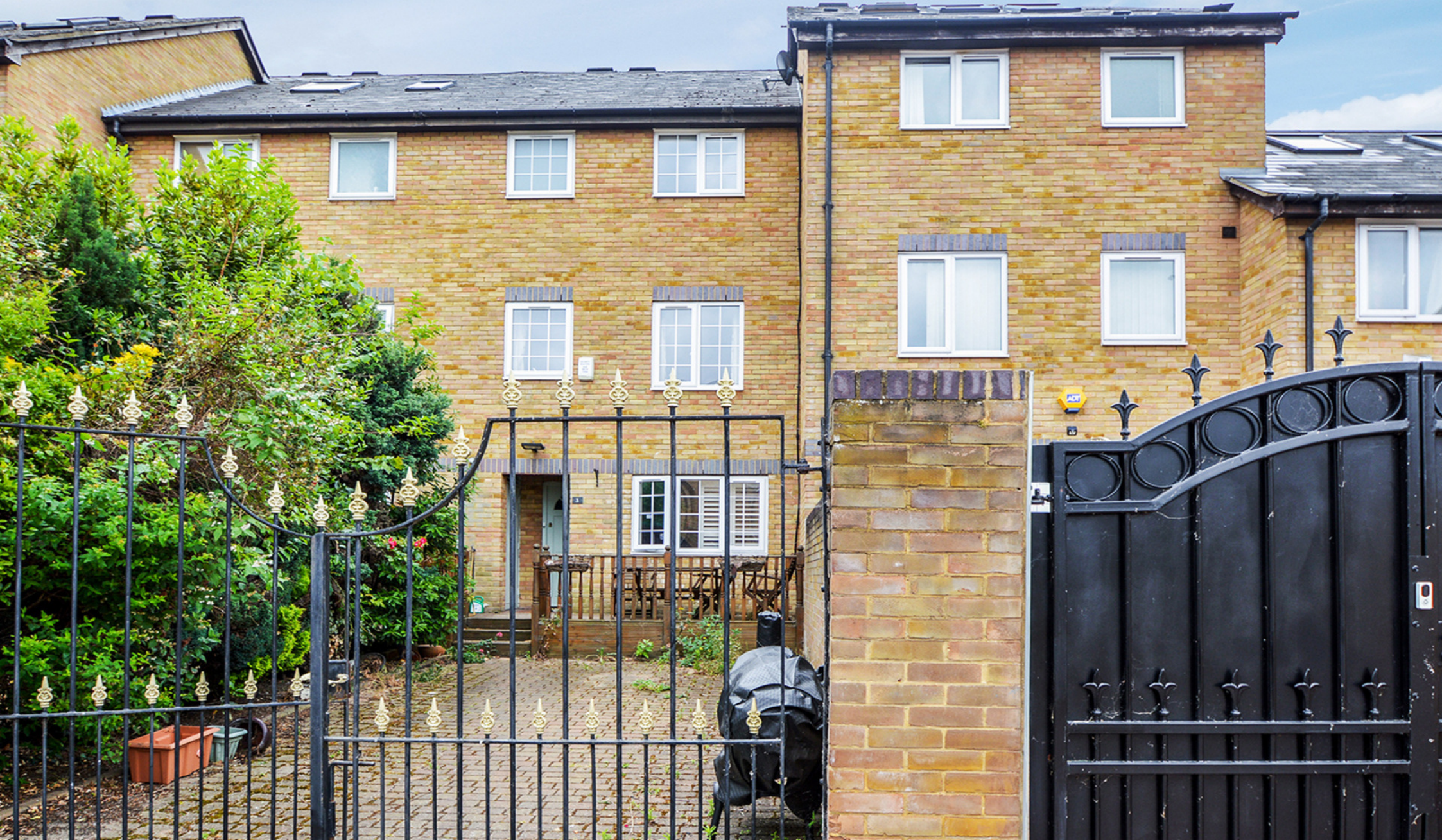
GUNWHALE CLOSE SE16 4 bedroom terraced house