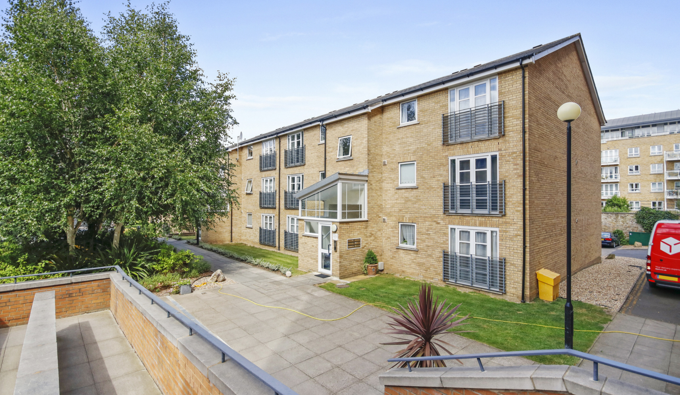
LANGBOURNE PLACE E14 2 bedroom apartment