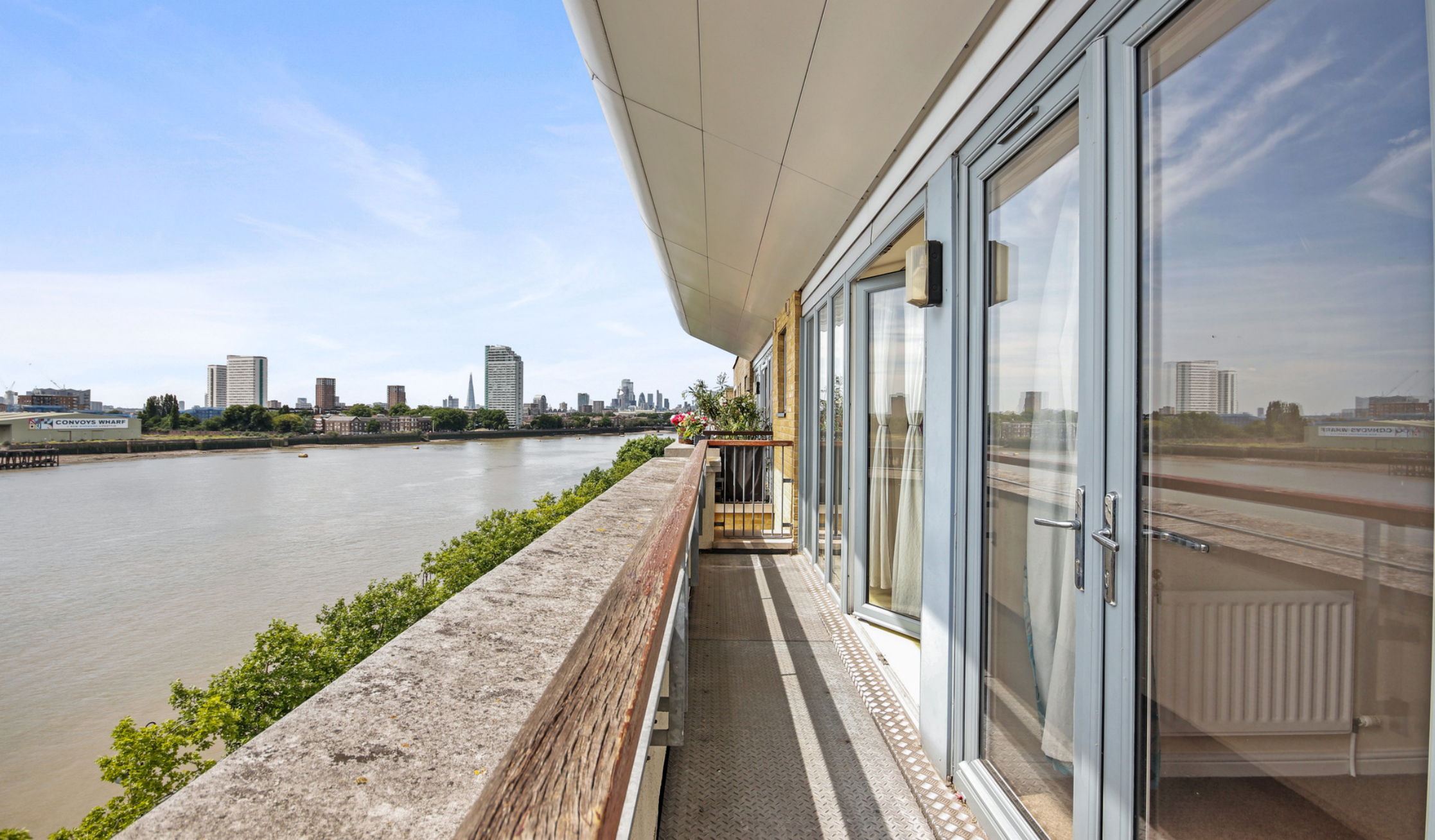
PERRY COURT E14 2 bedroom apartment