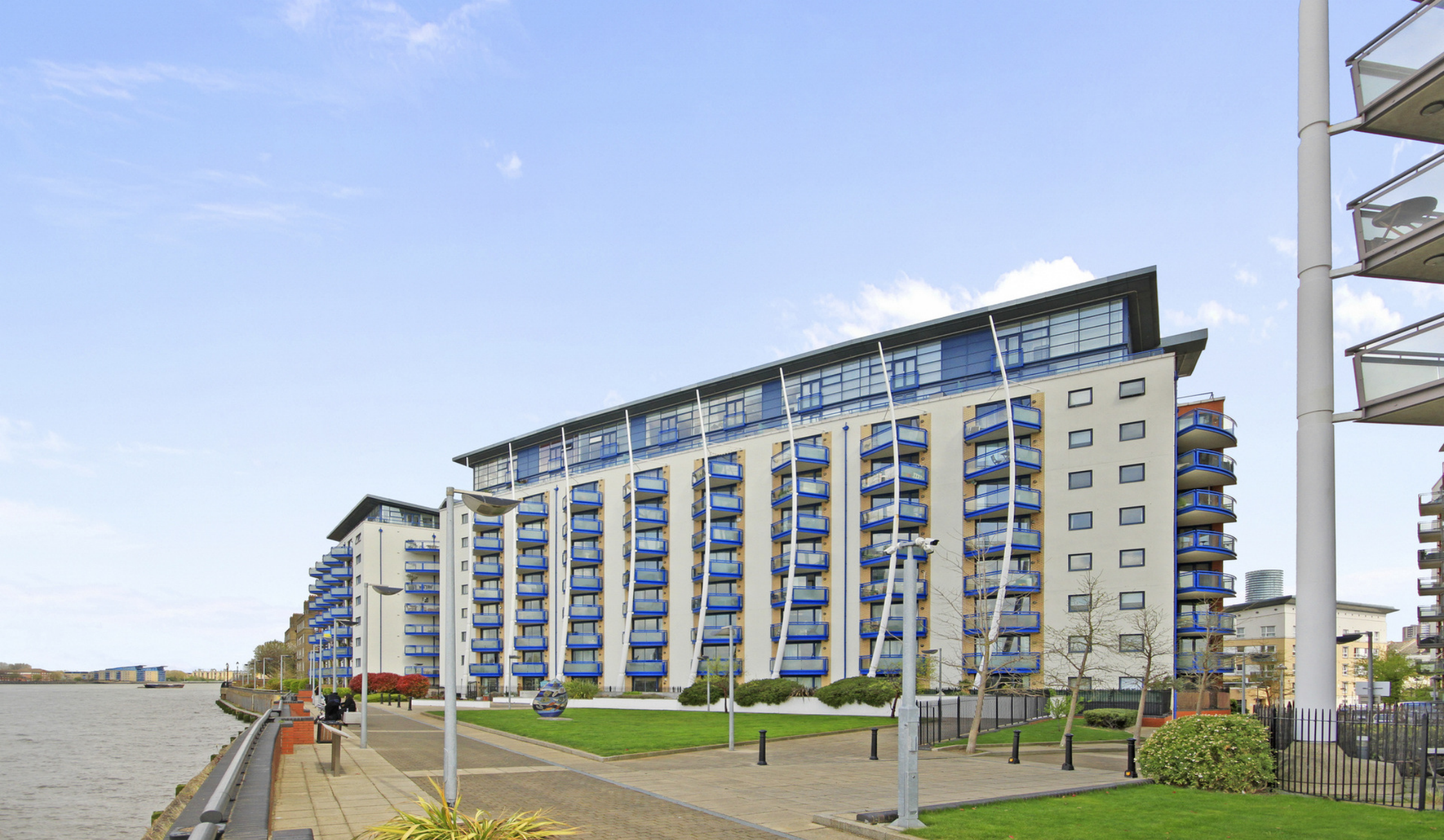
NOVA BUILDING E14 2 bedroom apartment