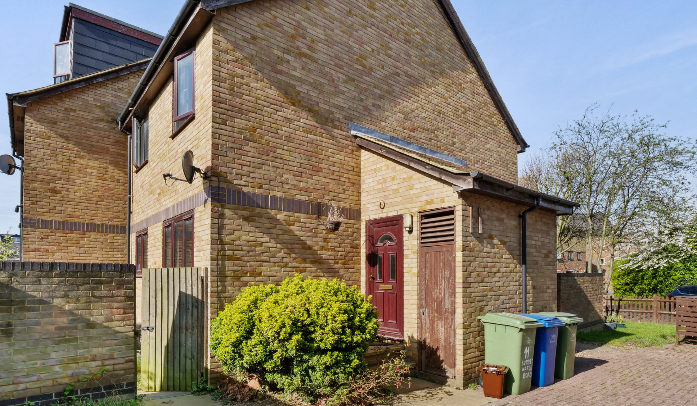
SURREY WATER ROAD SE16 1 bedroom terraced house