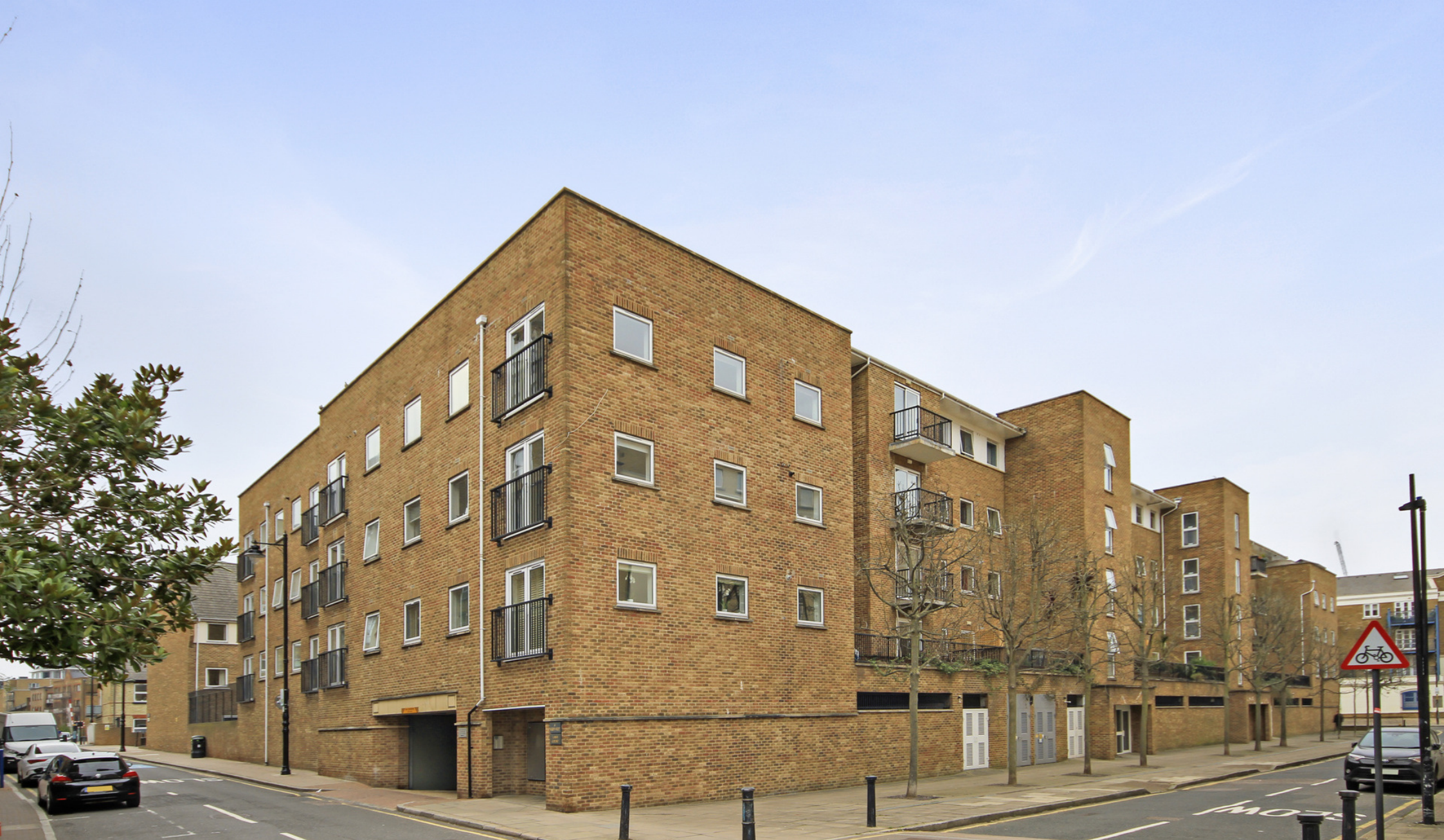
LAMB COURT E14 2 bedroom apartment