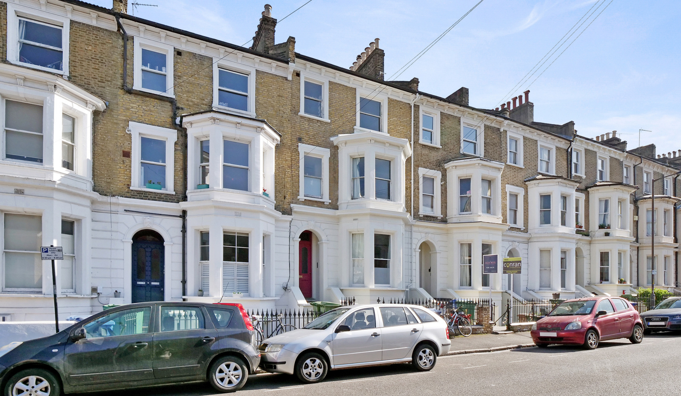
DAGMAR ROAD SE5 2 bedroom maisonette