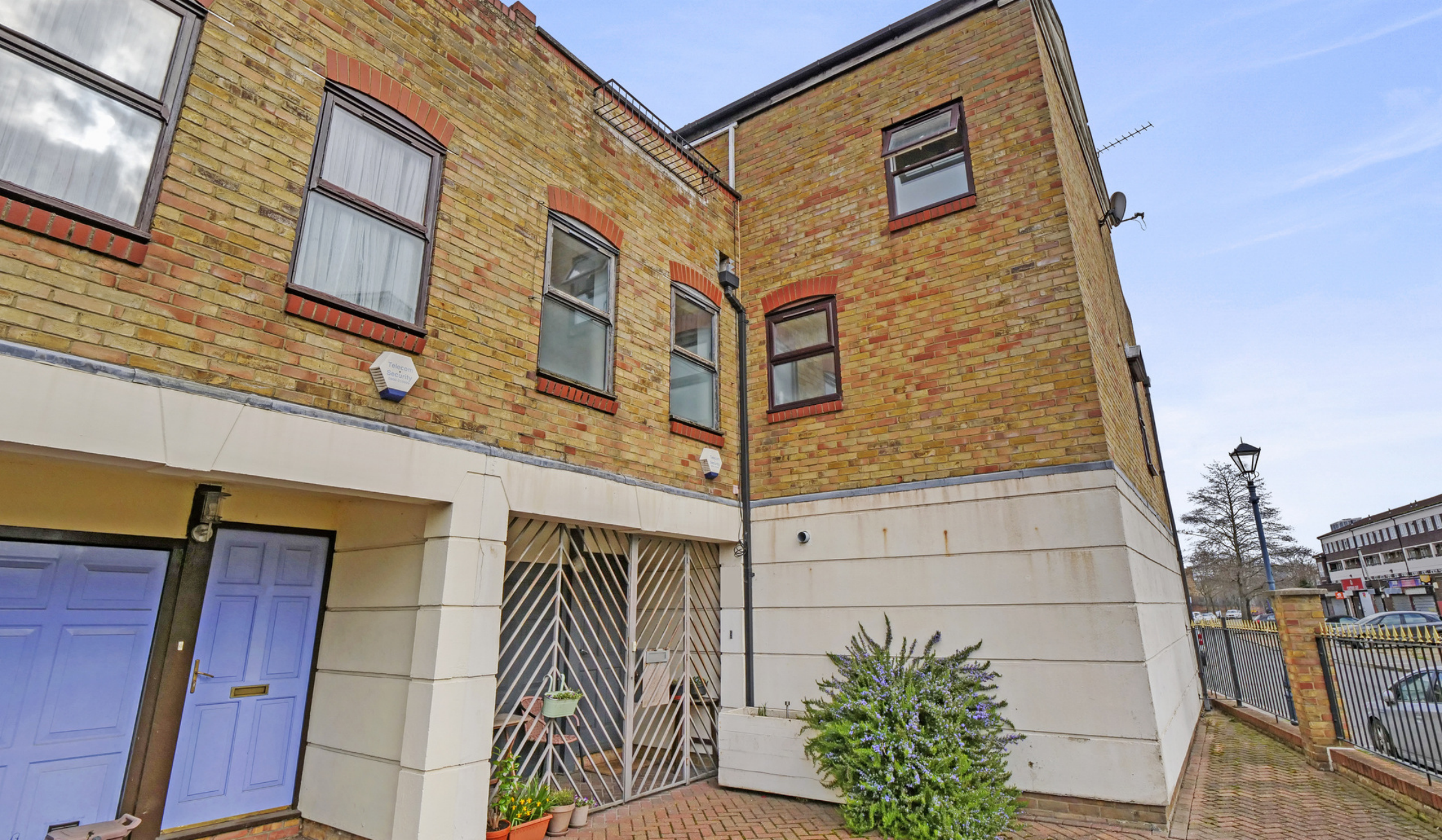
MALMESBURY ROAD E3 1 bedroom town house