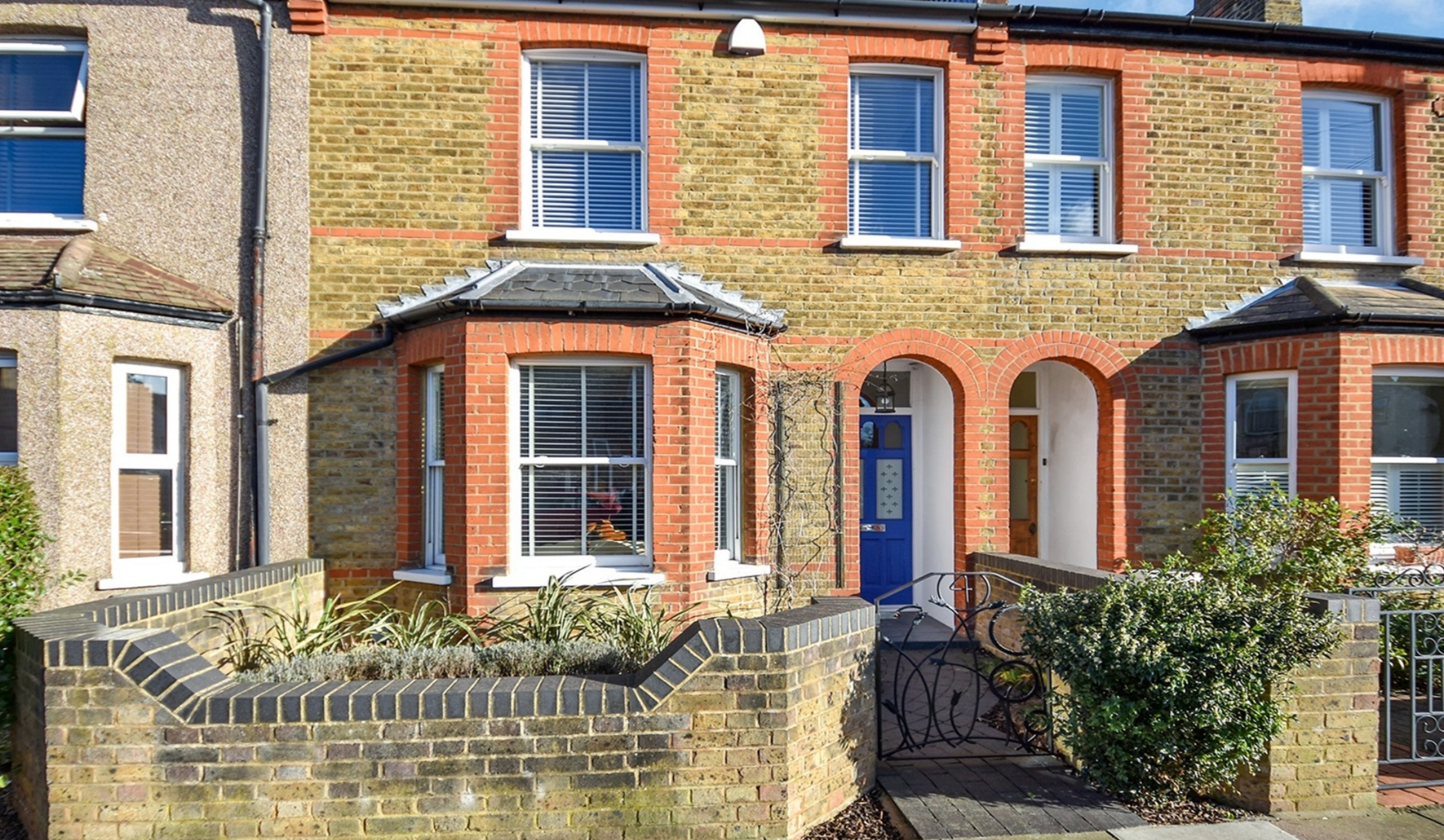
MOSSLEA ROAD BR2 2 bedroom terraced house