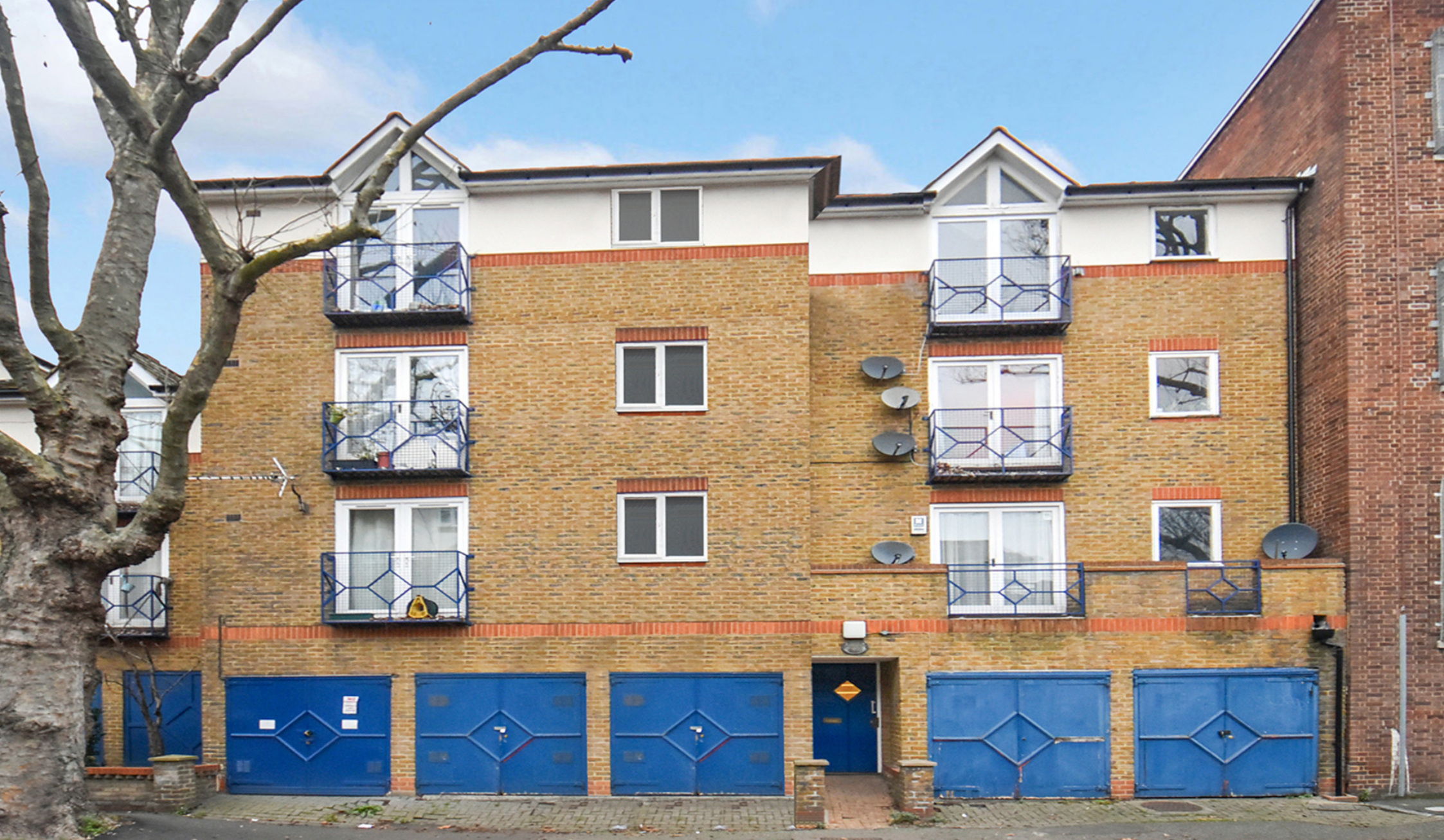
LIMETREE HOUSE SE8 1 bedroom apartment