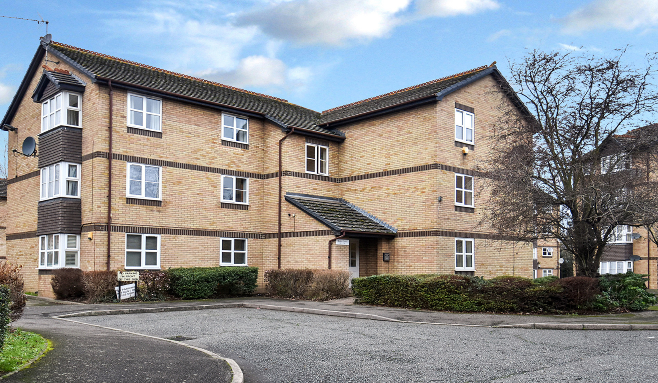
BLAKE COURT SE16 1 bedroom apartment