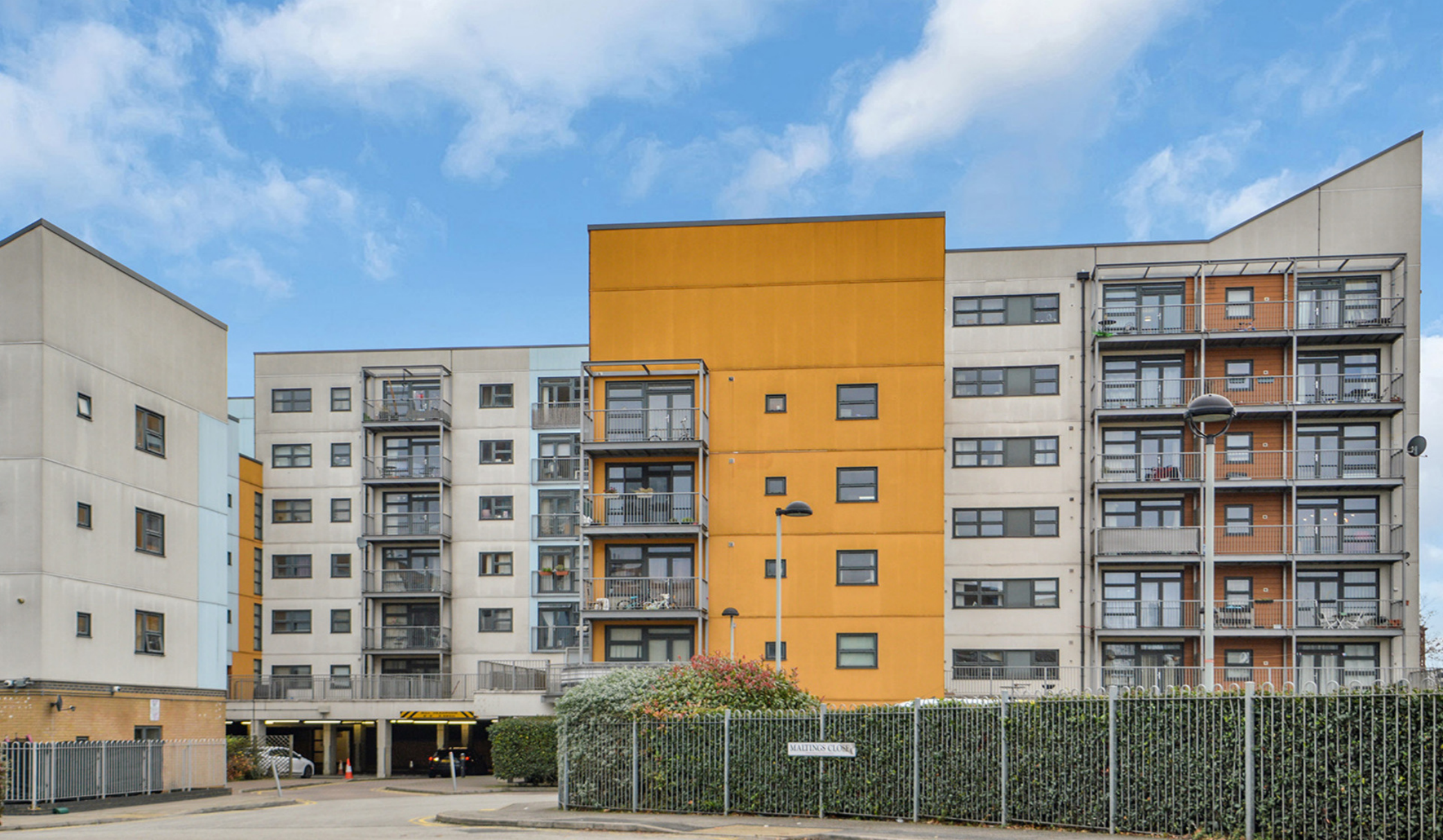
MALTINGS CLOSE E3 2 bedroom apartment