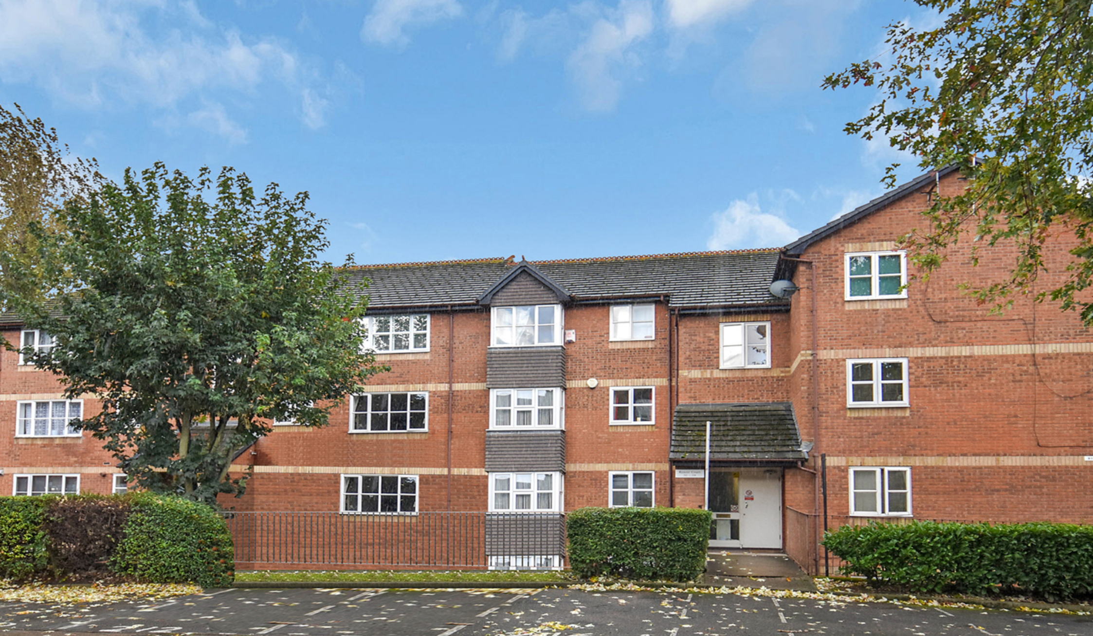
RENOIR COURT SE16 2 bedroom apartment