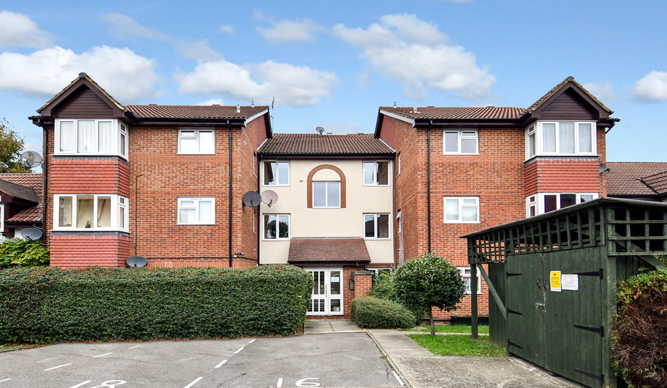
STERLING GARDENS SE14 1 bedroom apartment