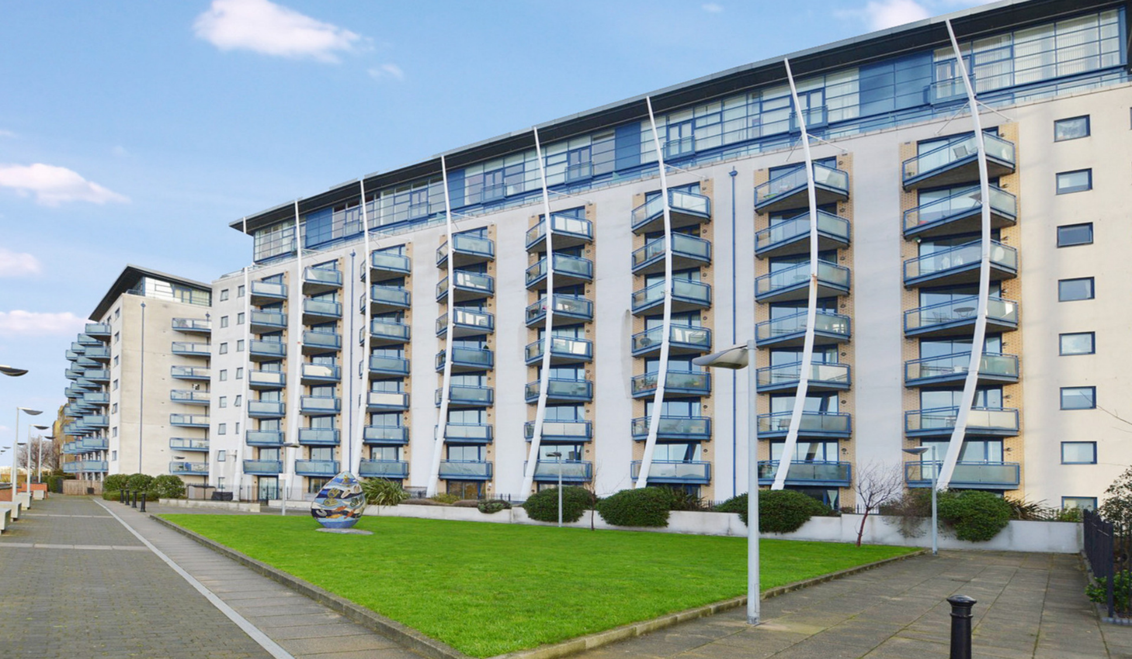
NOVA BUILDING E14 2 bedroom apartment