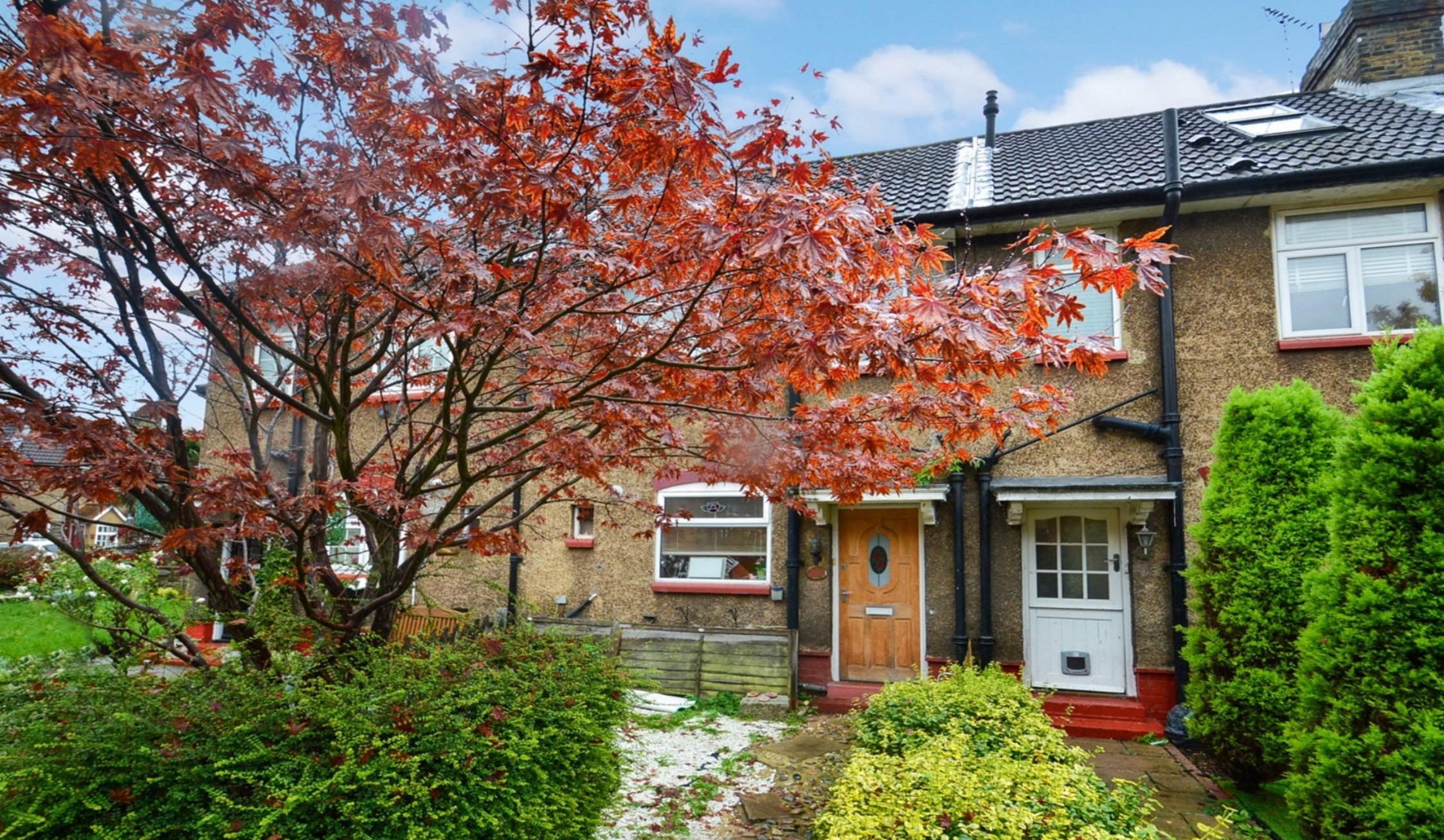
HESPERUS CRESCENT E14 2 bedroom terraced house