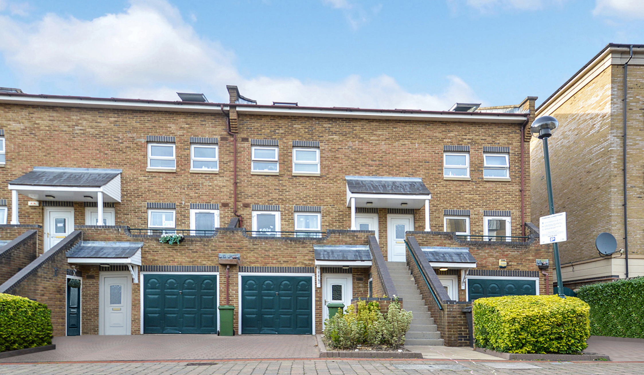
SCHOONER CLOSE E14 2 bedroom maisonette