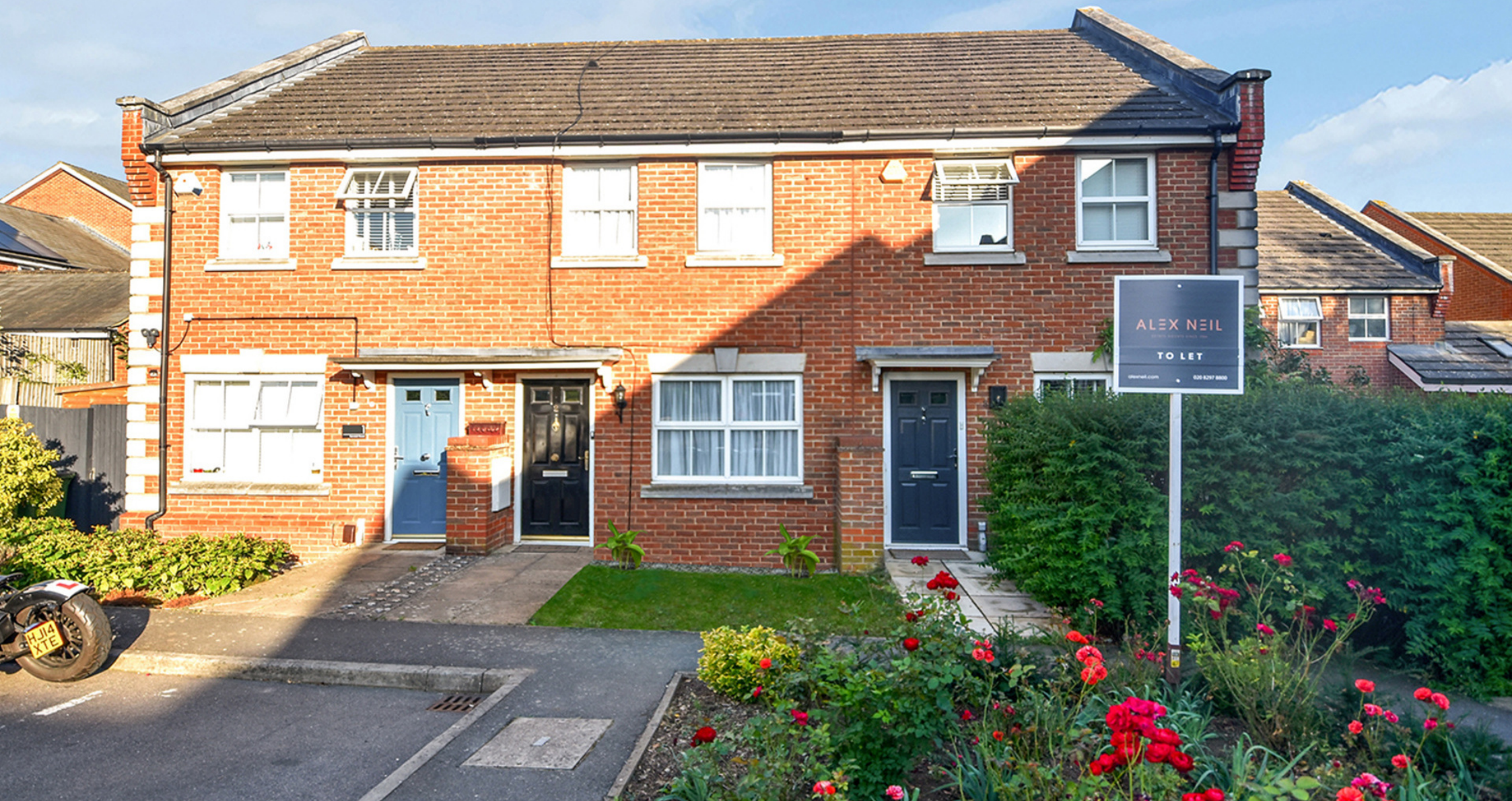
KENDALL ROAD SE18 2 bedroom end of terrace