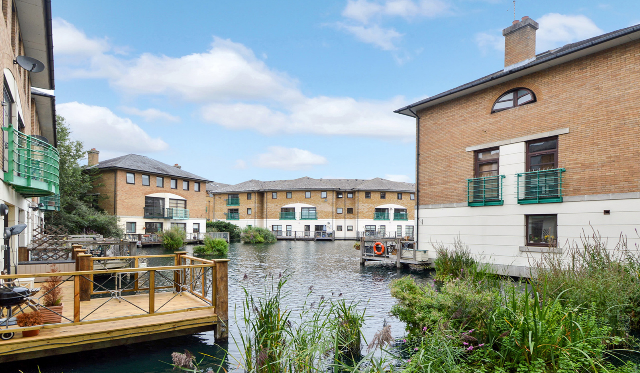
FINLAND STREET SE16 4 bedroom town house