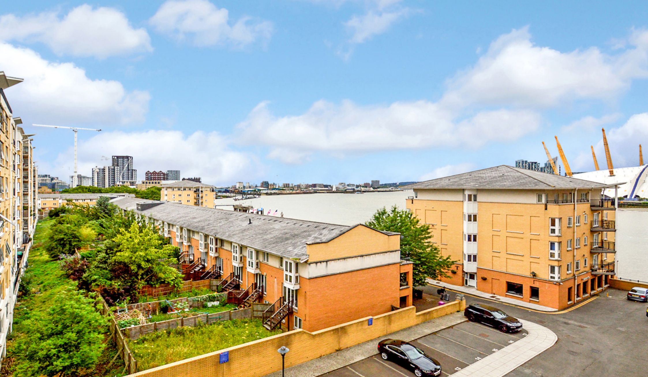
STUDLEY COURT E14 2 bedroom apartment