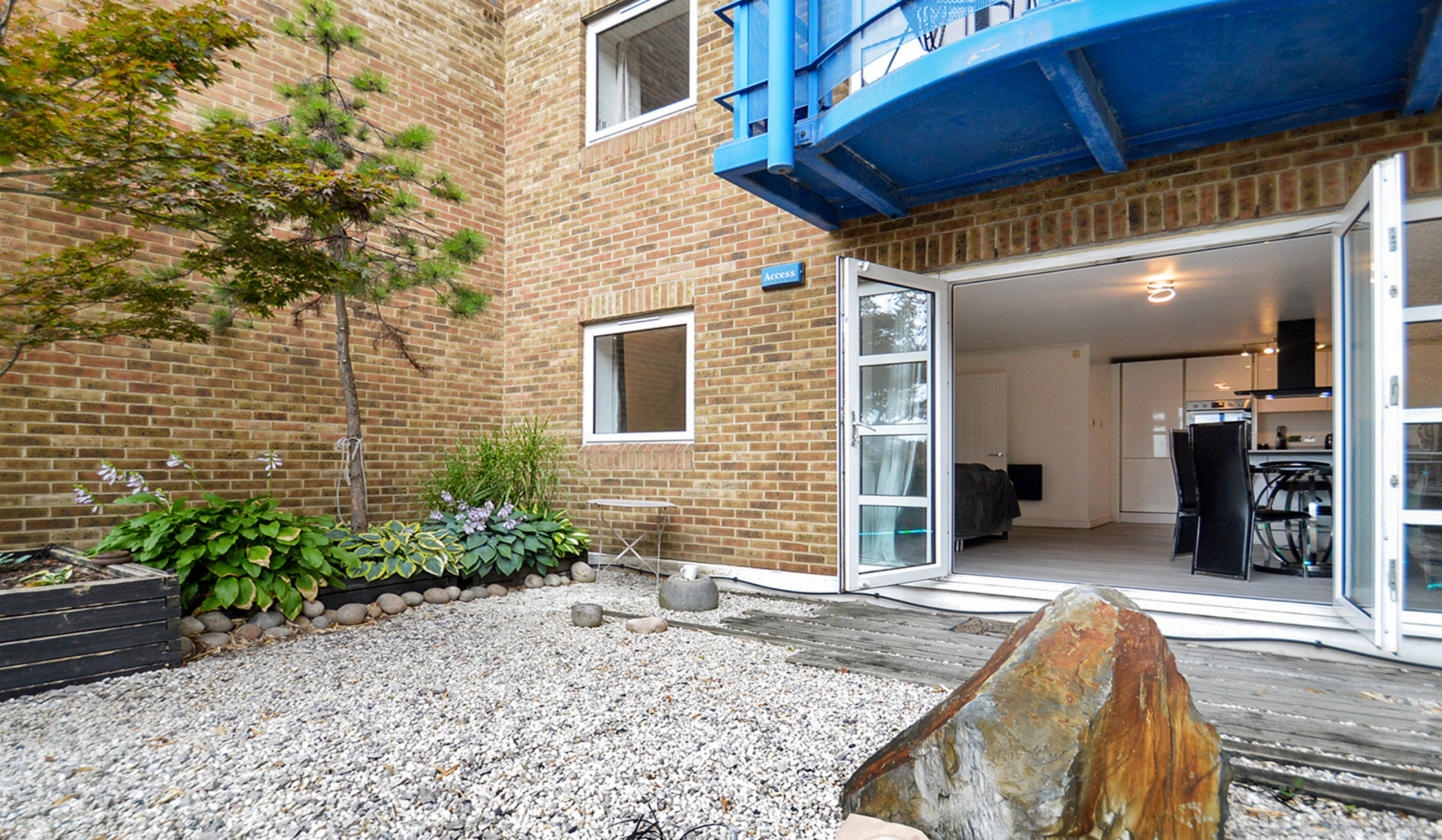
SCOTIA BUILDING E1W 2 bedroom apartment