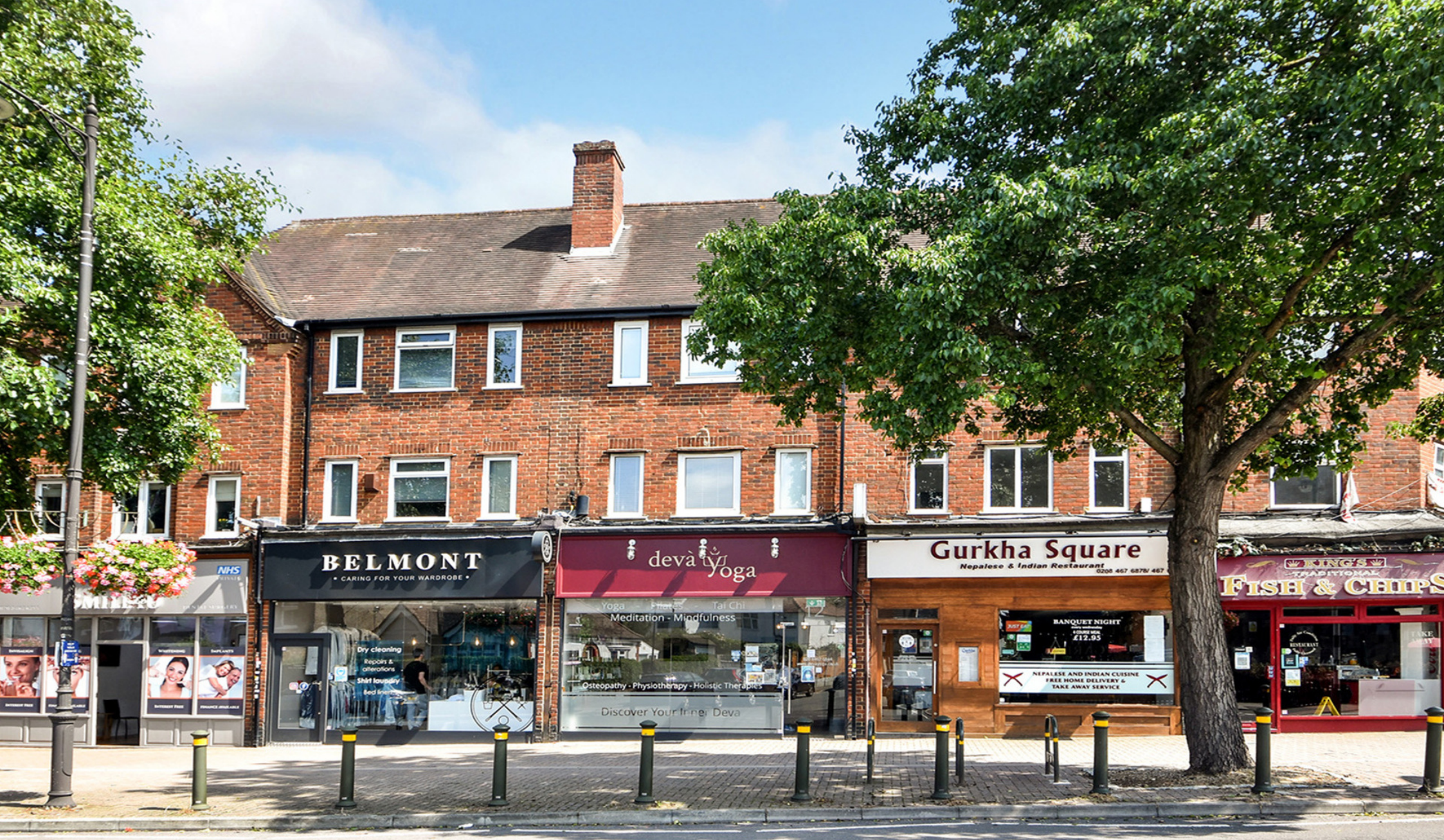
BELMONT PARADE BR7 4 bedroom maisonette