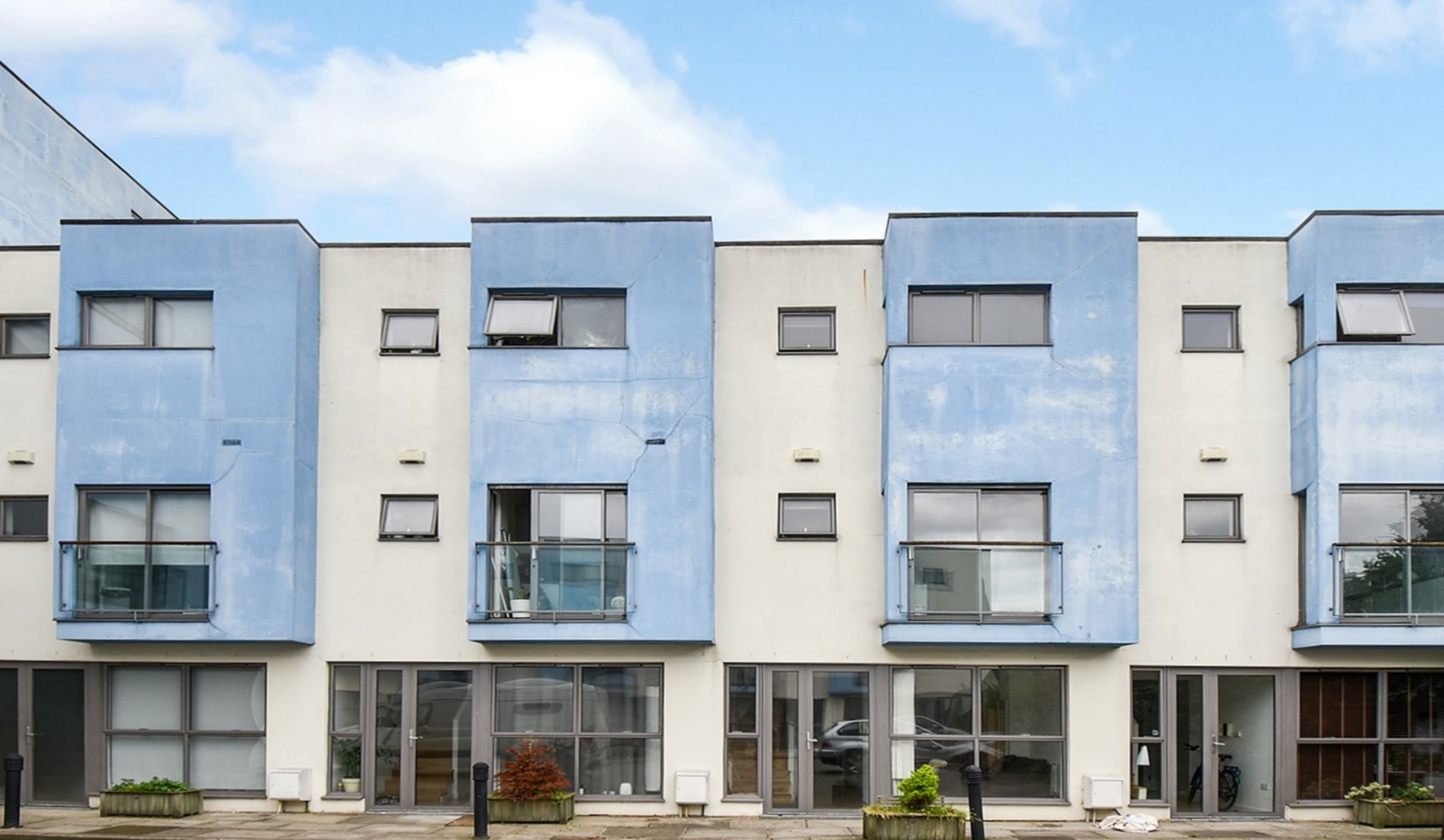
JUSTINES PLACE E2 2 bedroom apartment