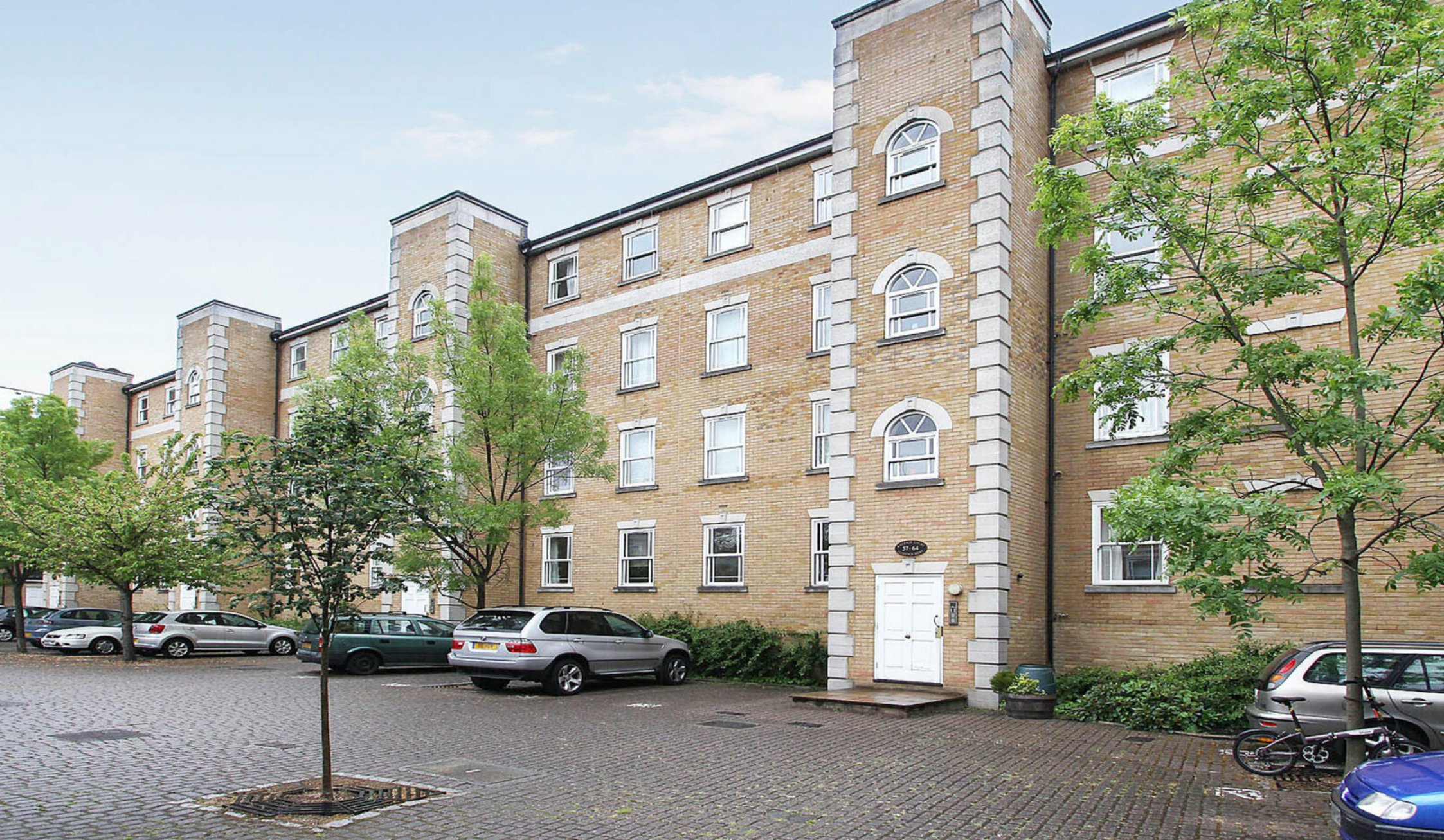
RALEIGH COURT SE16 2 bedroom apartment