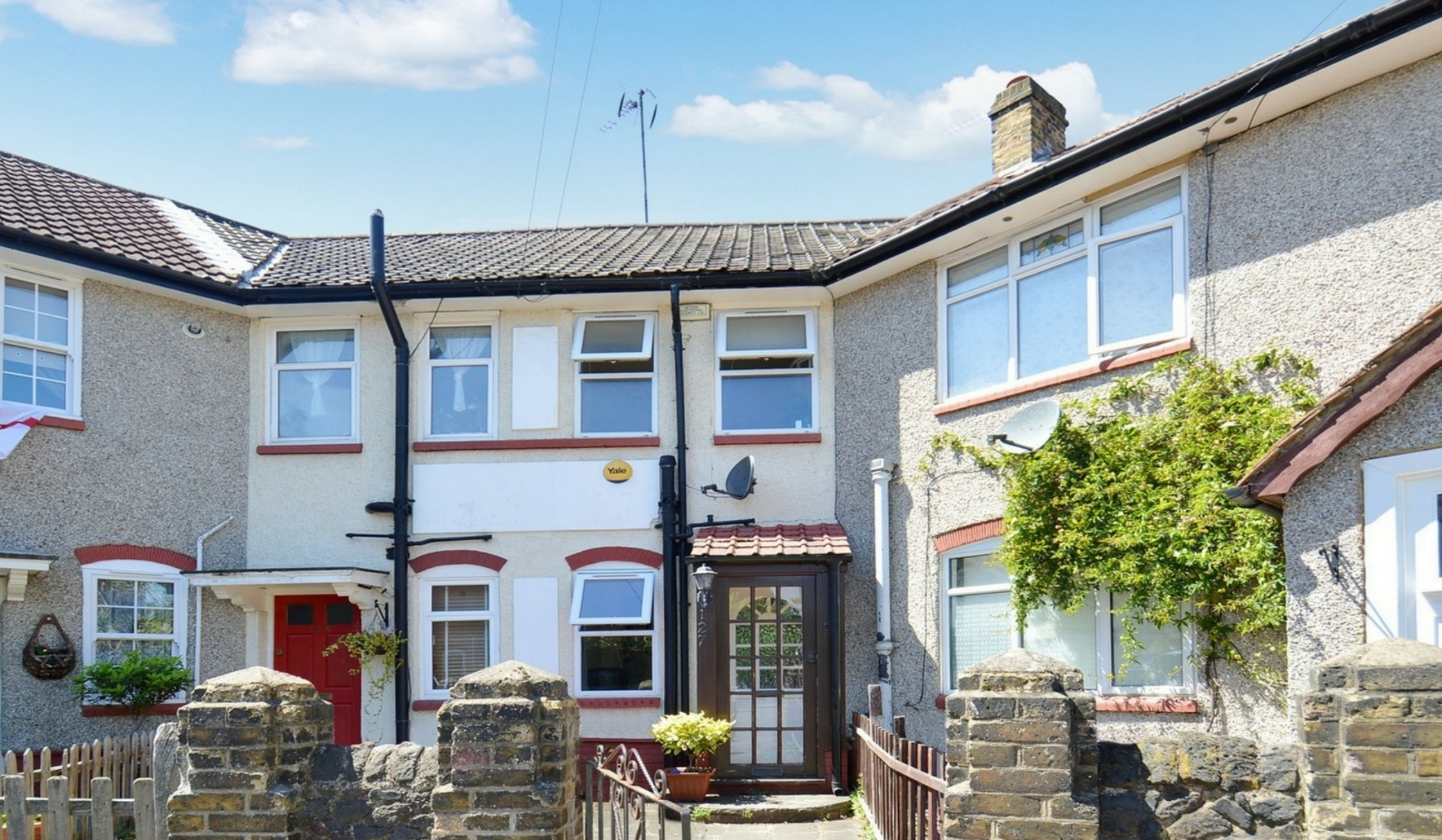
HESPERUS CRESCENT E14 2 bedroom terraced house