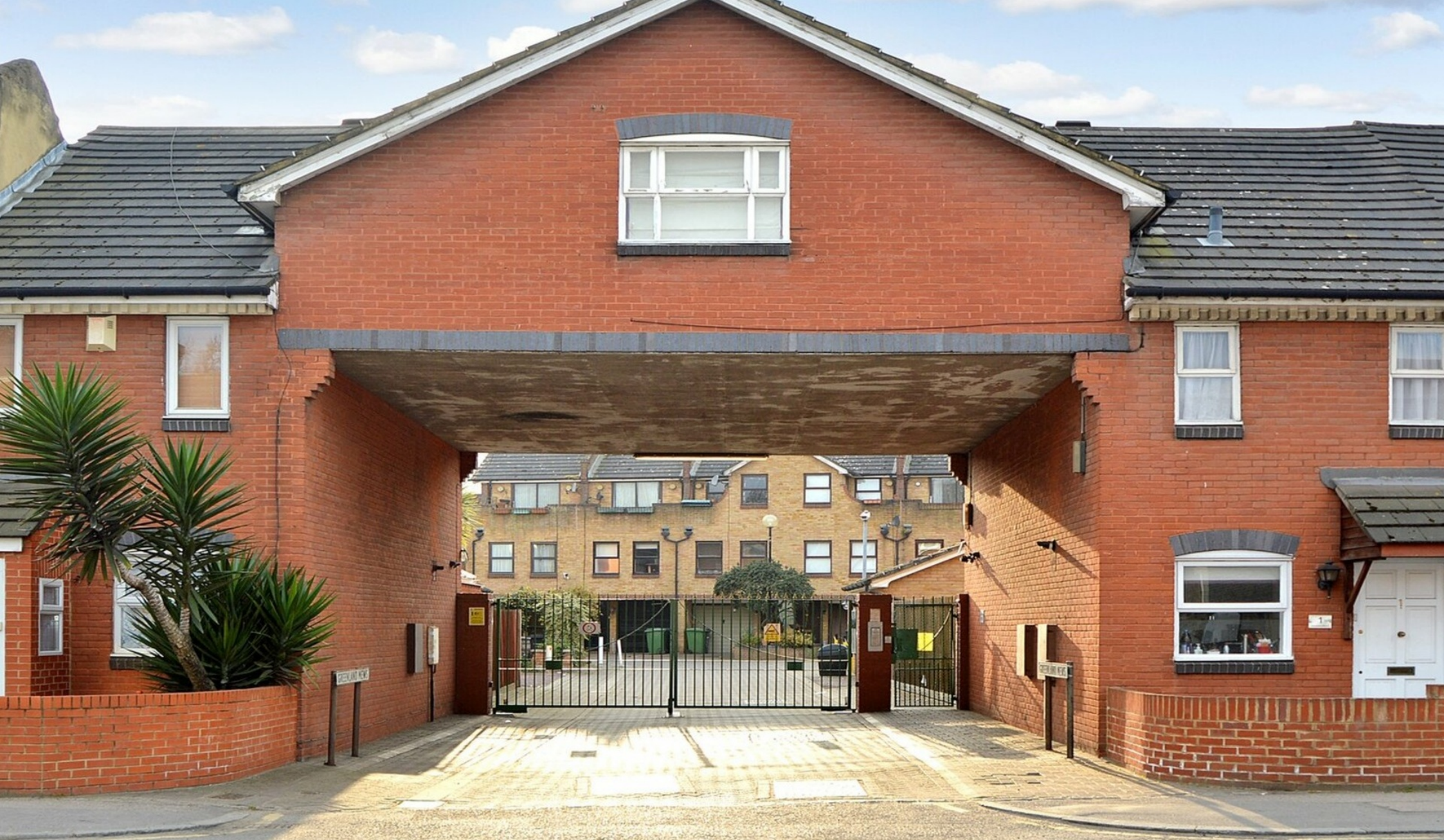
GREENLAND MEWS SE8 3 bedroom terraced house