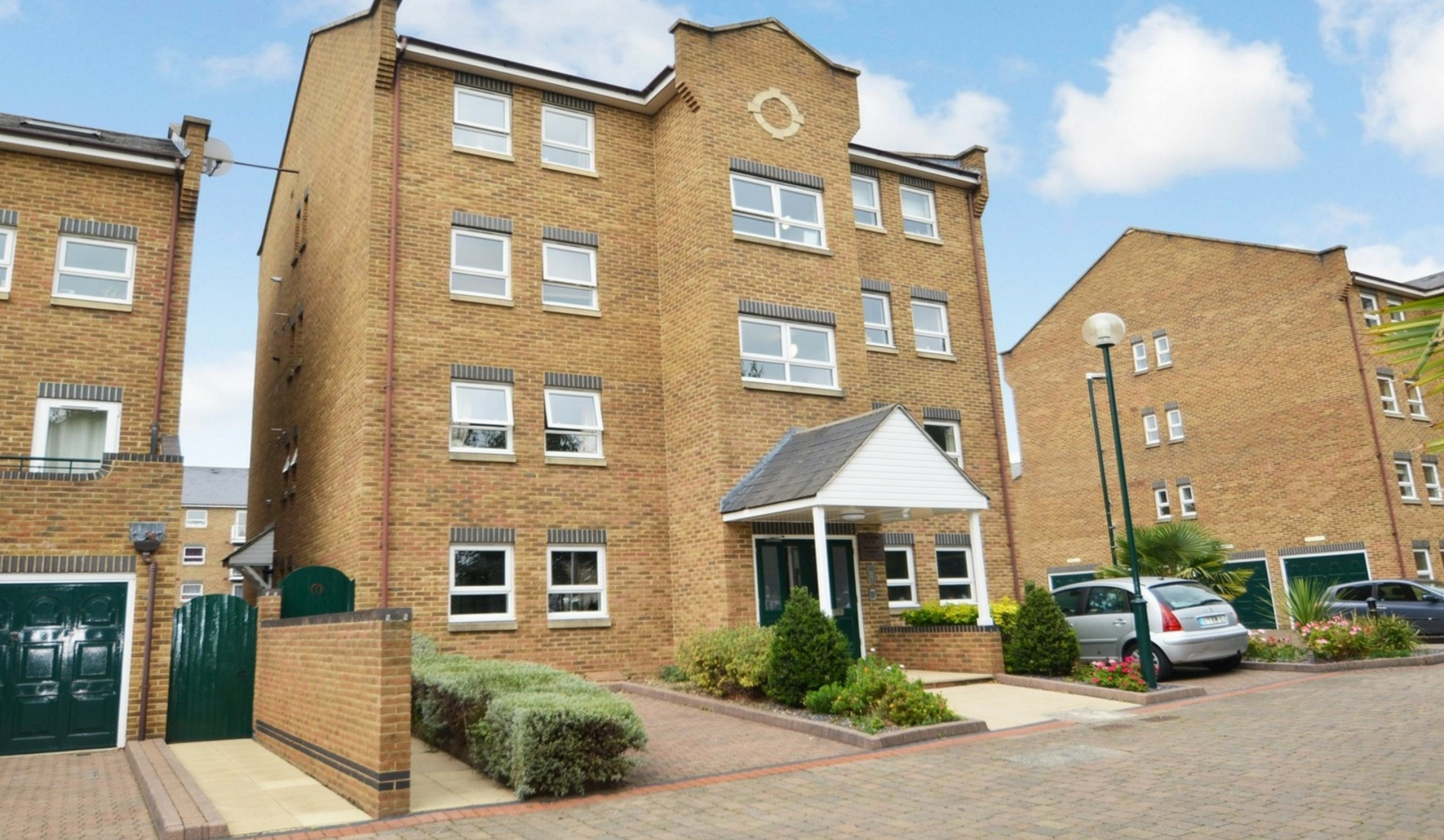
BEAULIEU LODGE E14 2 bedroom apartment