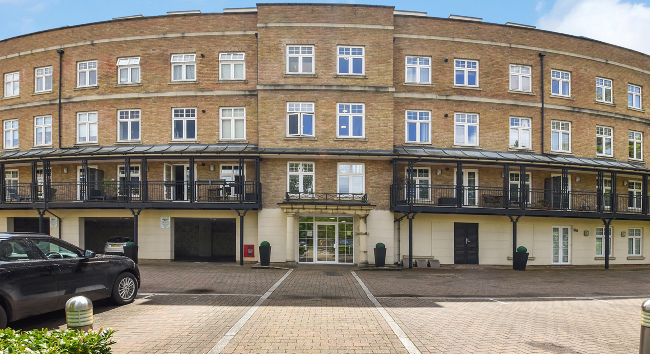
RHODES COURT BR2 1 bedroom apartment