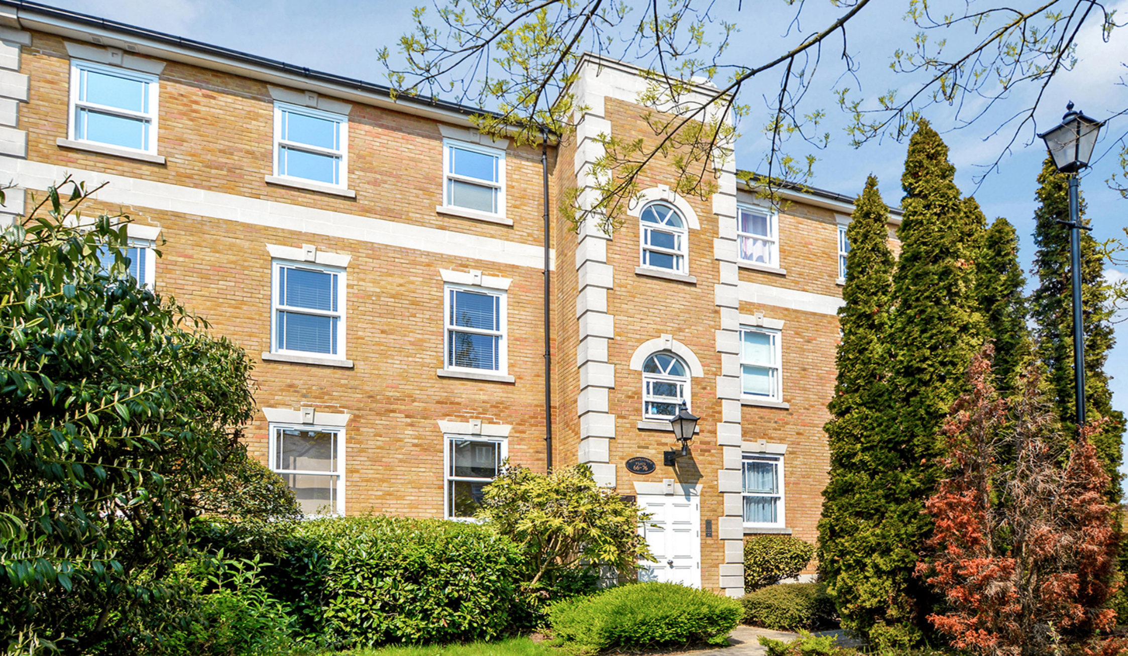
NELSON COURT SE16 2 bedroom apartment