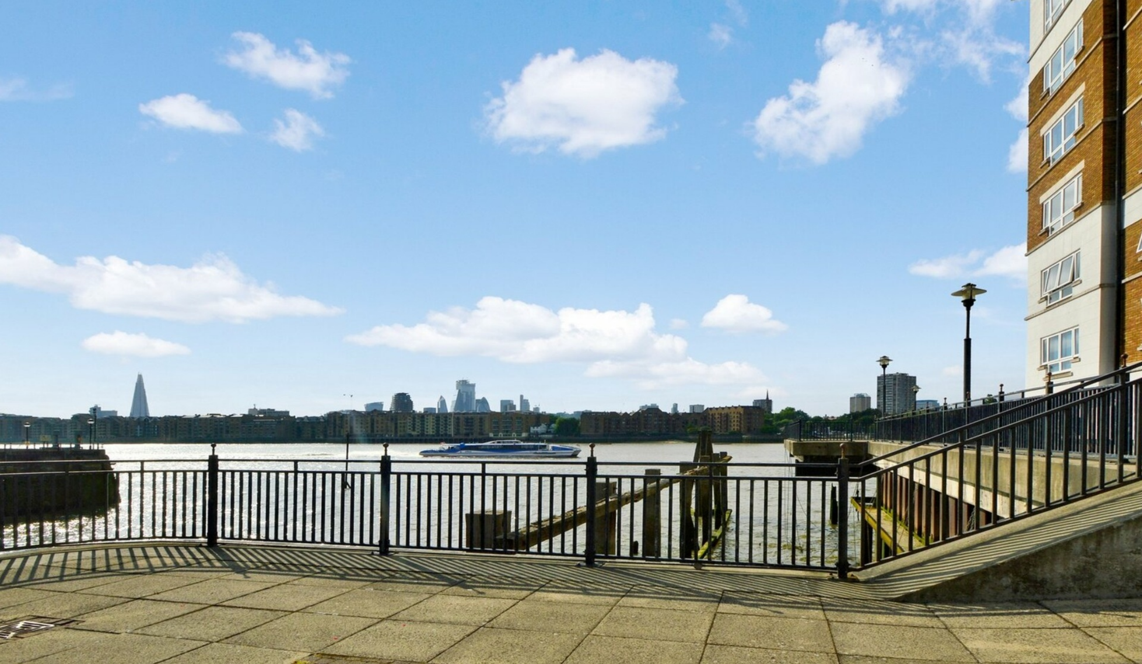
TUDOR COURT SE16 2 bedroom apartment