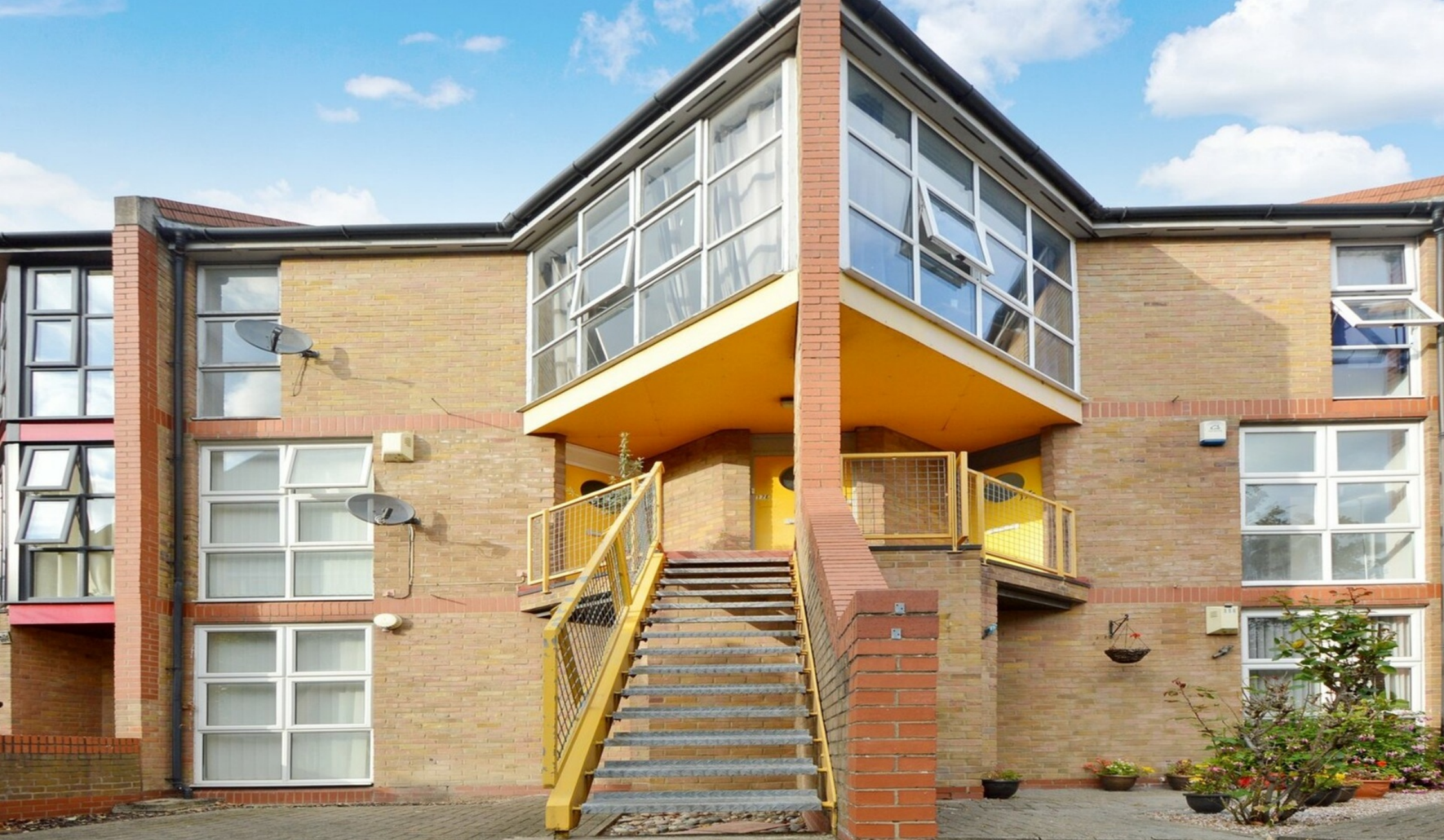
HOLYOAKE COURT SE16 2 bedroom apartment