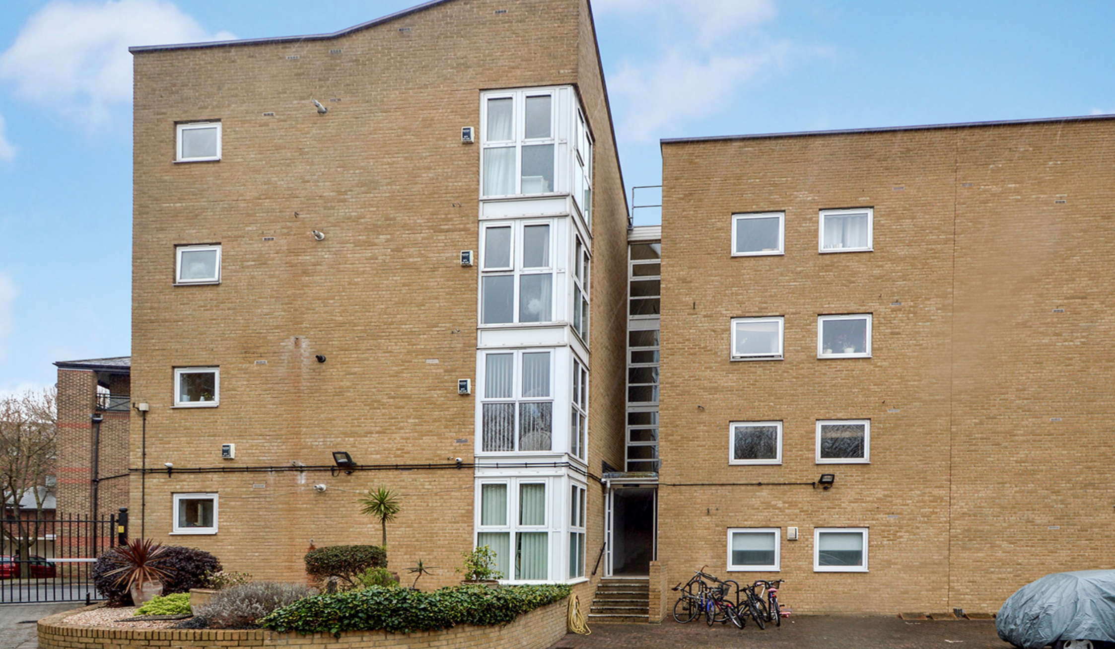
HUDSON YARD HOUSE SE16 1 bedroom apartment