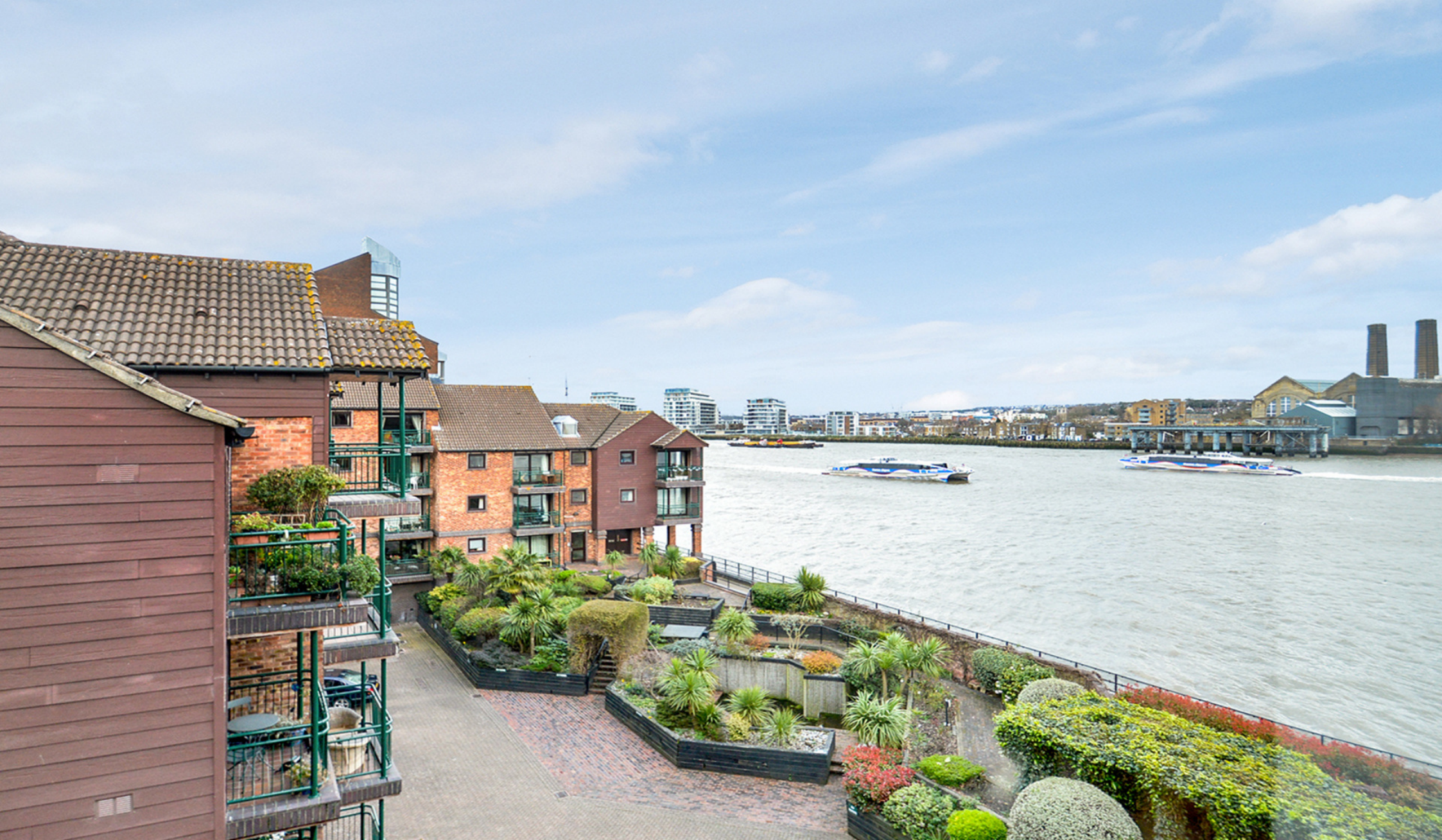
LURALDA WHARF E14 2 bedroom apartment