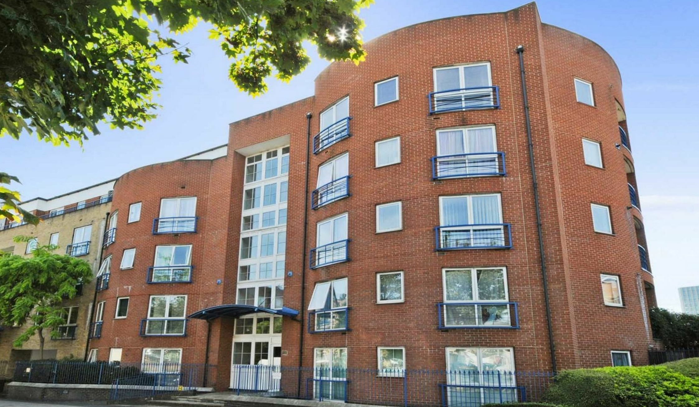
CARAWAY HEIGHTS E14 2 bedroom apartment