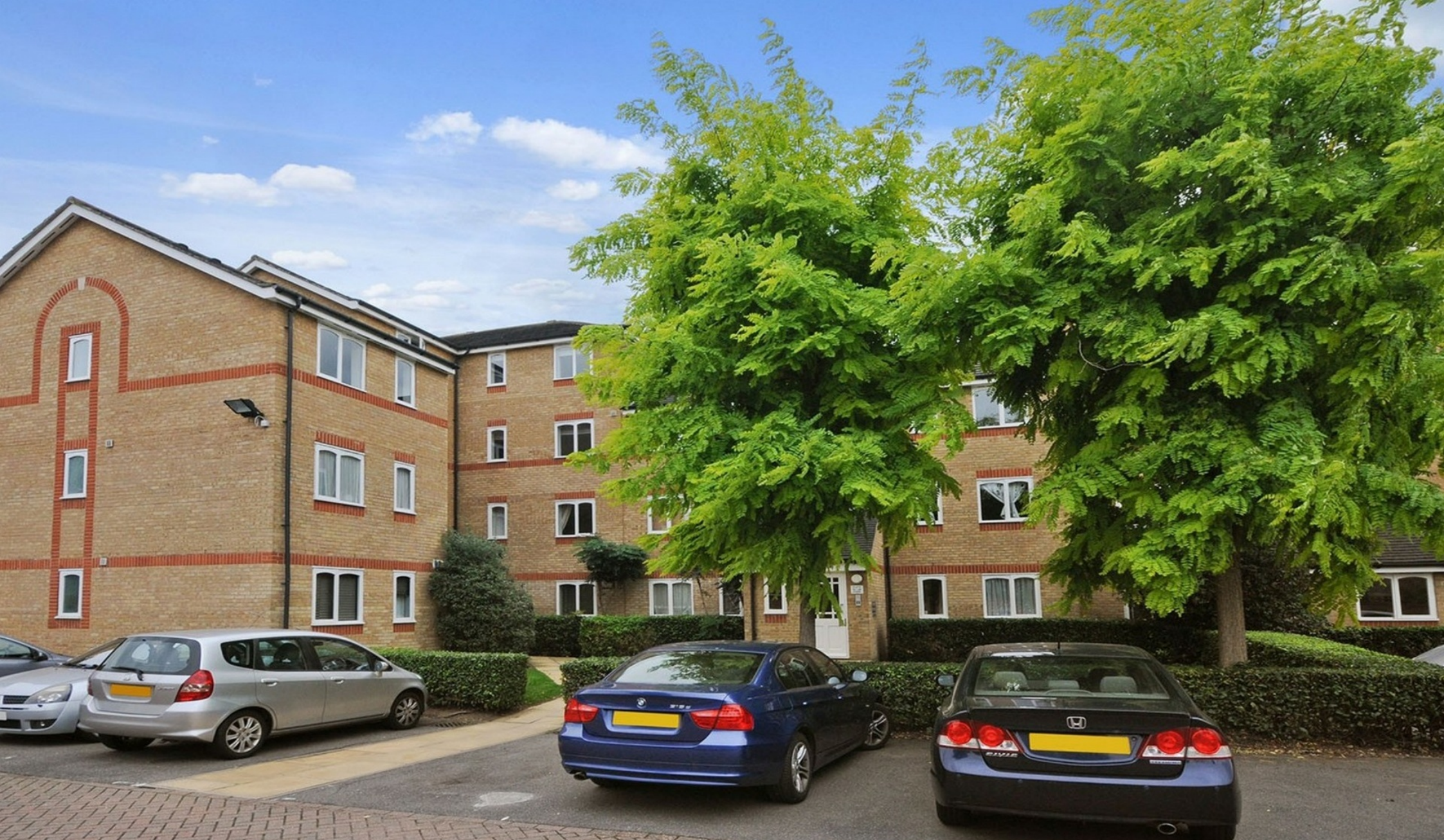
TELEGRAPH PLACE E14 2 bedroom apartment