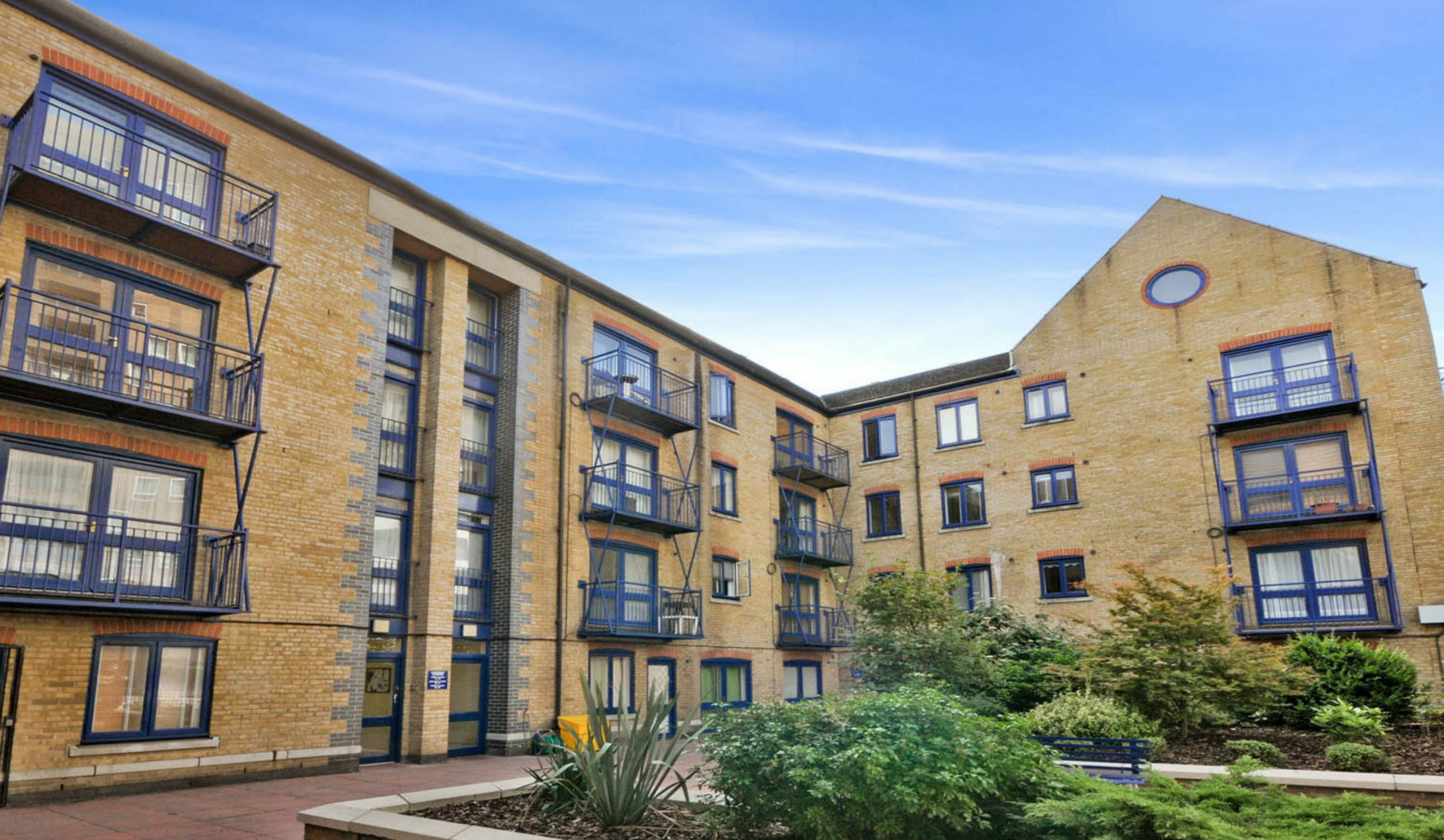
PENINSULA COURT E14 2 bedroom apartment