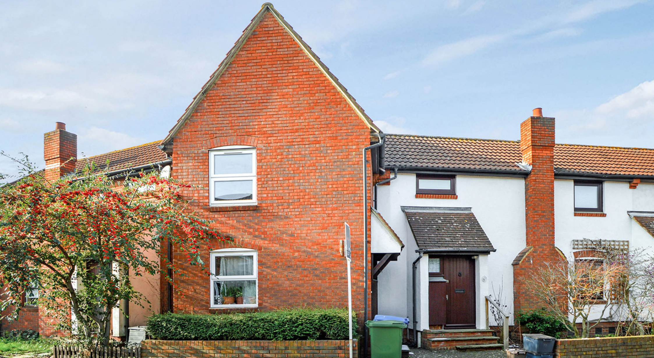
HOWLAND WAY SE16 2 bedroom terraced house