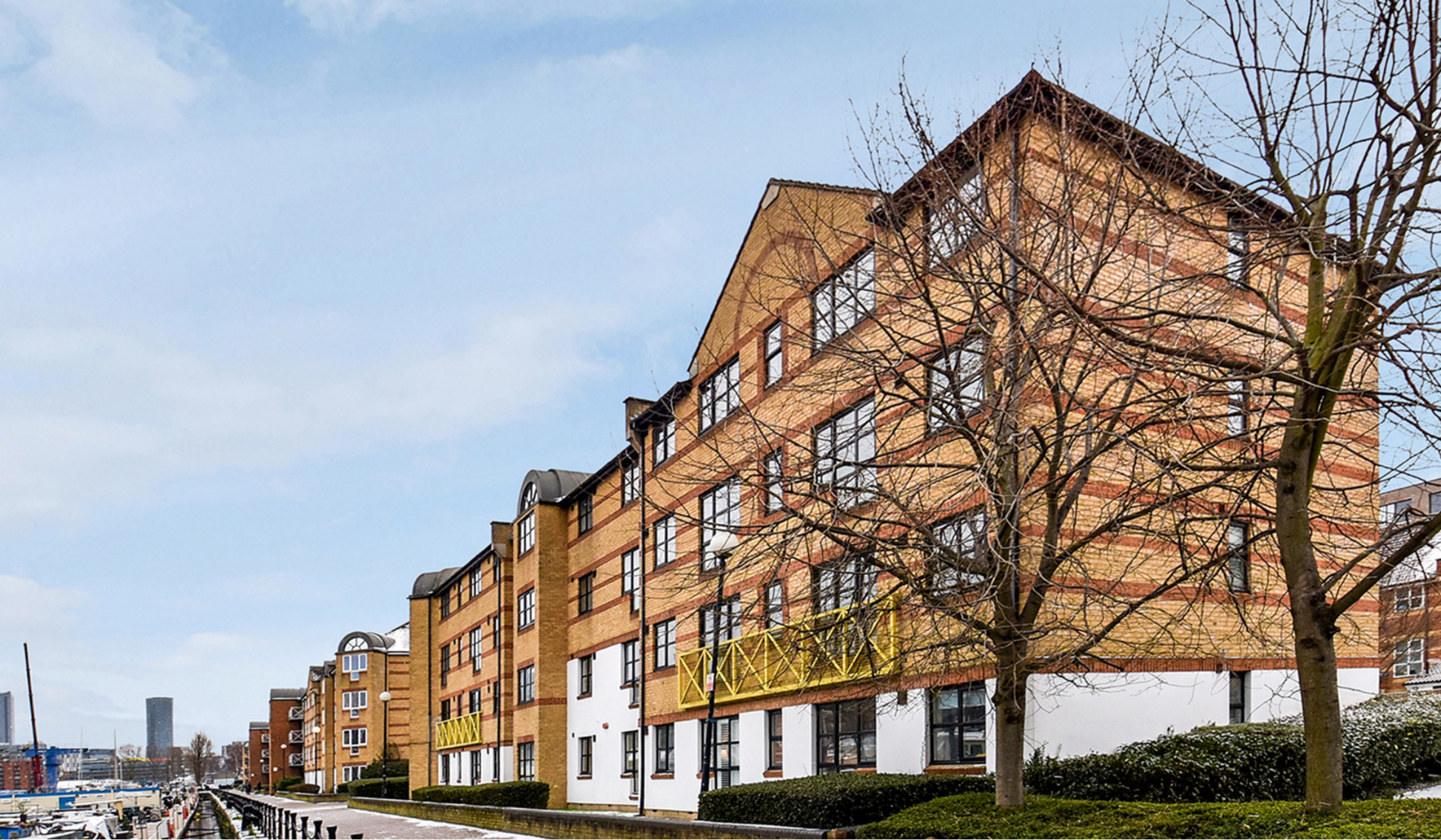
TRANSOM CLOSE SE16 2 bedroom apartment