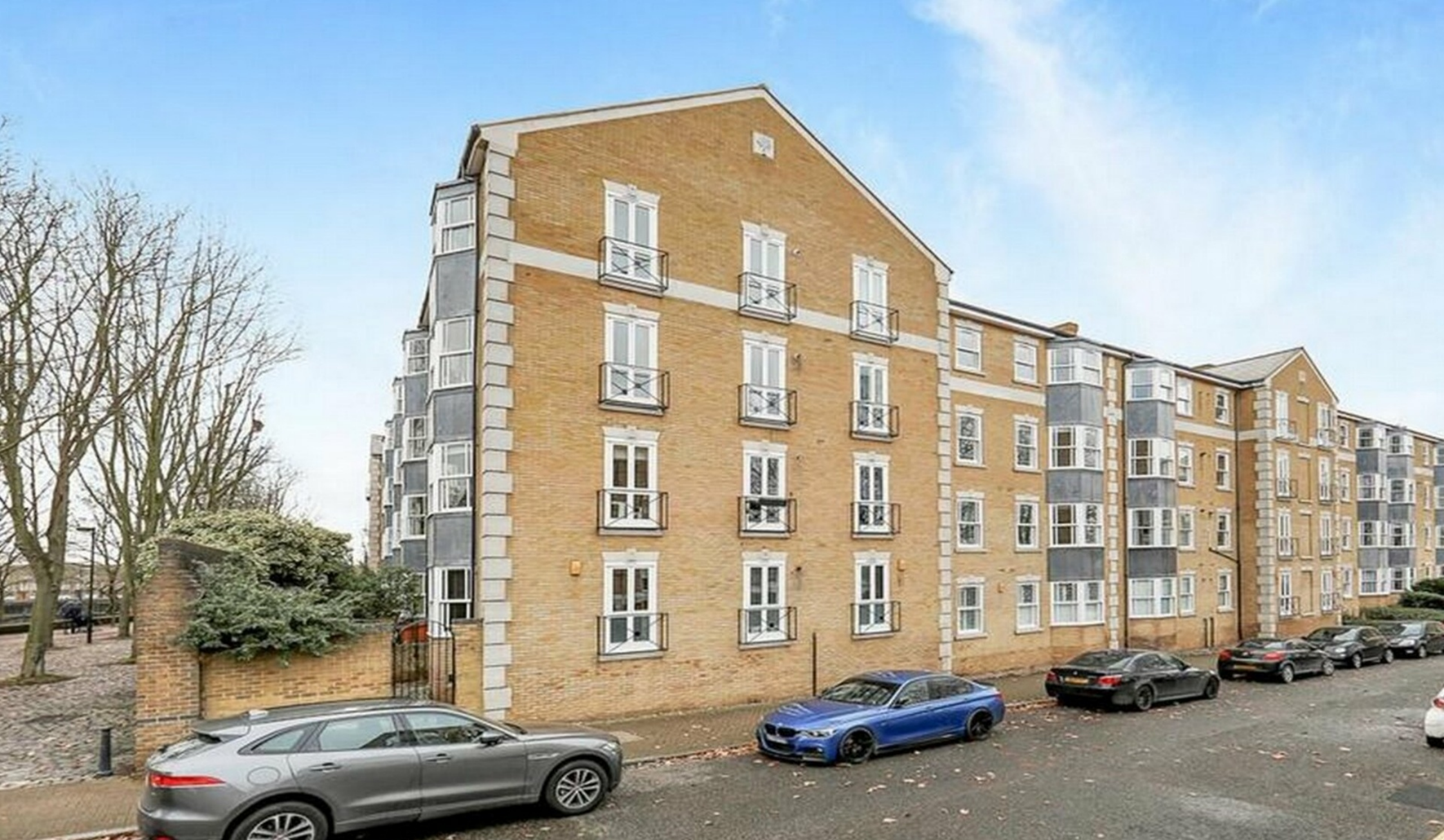
RALEIGH COURT SE16 2 bedroom apartment