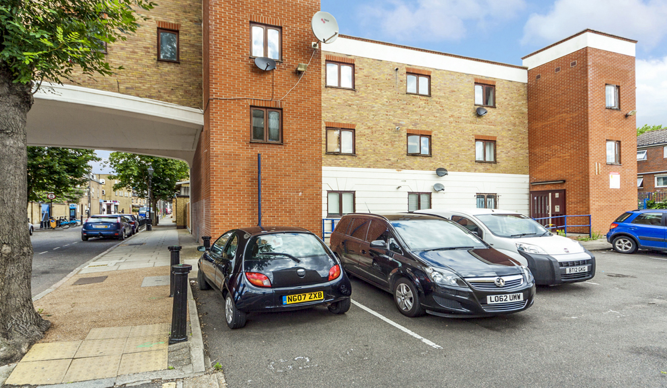
HEWISON STREET E3 1 bedroom apartment