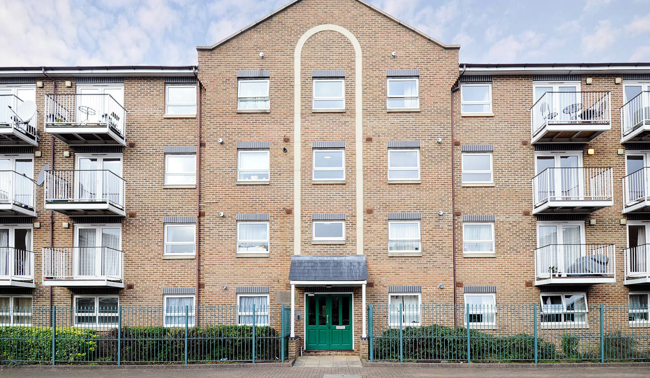
CADNAM LODGE E14 2 bedroom apartment