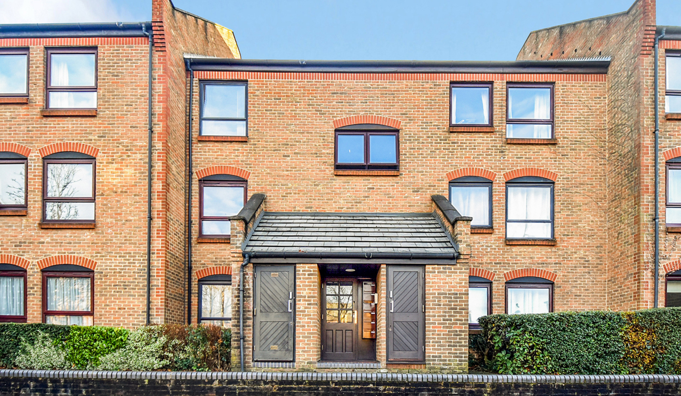
HORSESHOE CLOSE E14 2 bedroom apartment