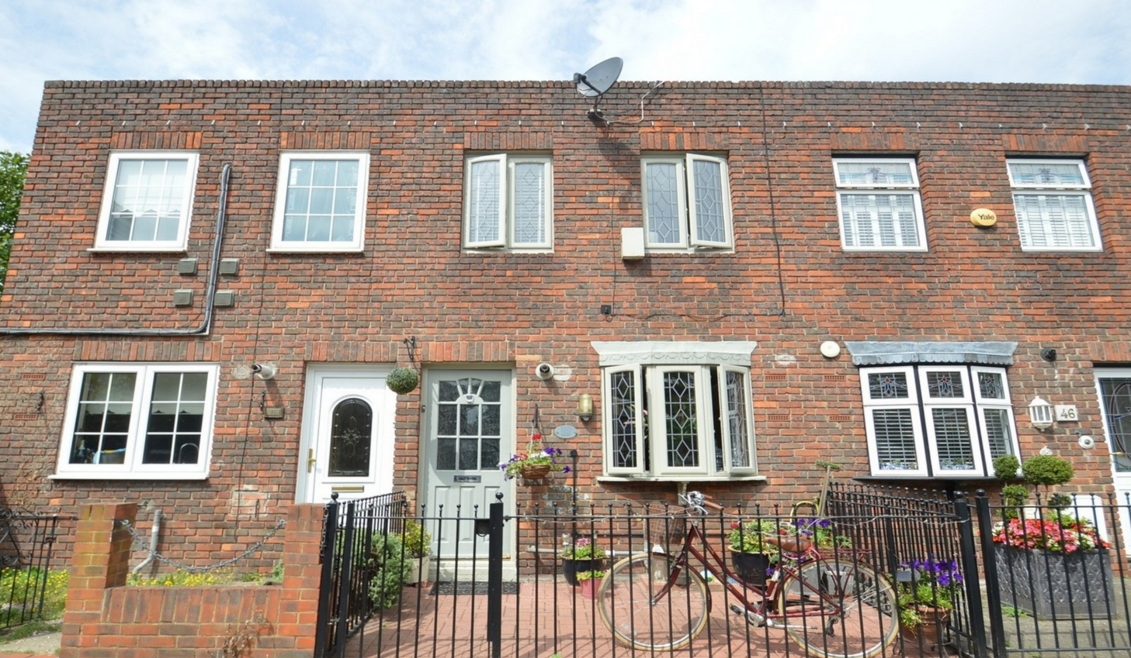
MING STREET E14 3 bedroom terraced house